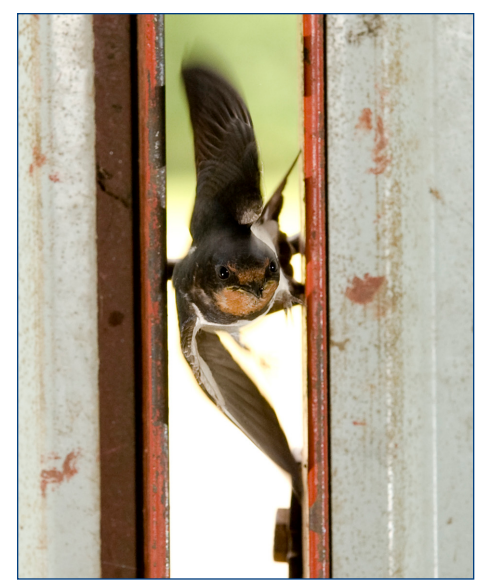
This Barn Swallow dove through the small space shown at top flight speed wer 30 miles per hour!