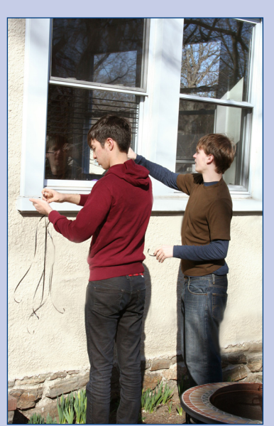
Window tape patterns are easy to apply and provide an effective deterrent against bird strikes.

Here are some quick and affordable ways to protect birds from your windows. These should be applied to the outside of the glass to break up reflections.