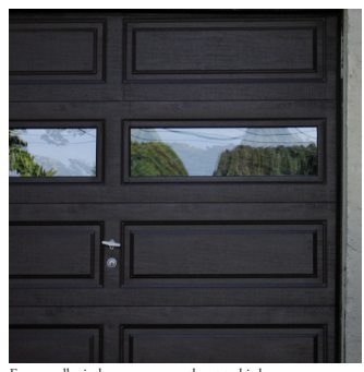
ren small windows can pose a threat to

Research has identified solutions to alert birds to windows. The easiest of these involve applying visible markings to the outside of windows in patterns that the birds can see while requiring minimal glass coverage to keep your view unobscured. Although we don't yet have all the