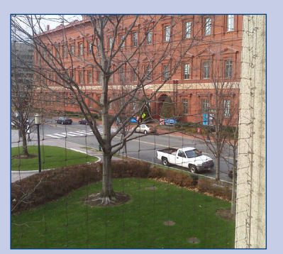
Window netting provides a see-through screen that will cut down on bird strikes.