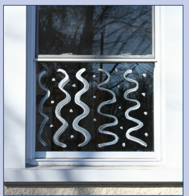
Tempera paint is a washable, long-lasting, and non-toxic solution to preventing hird/window collisions