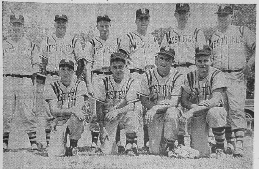
Westfield Nine Edged Out by Montello in 12 Innings —

The Westfield baseball team of the Central State League lost a 12-inning heart-breaker to Montello's Comets at Montello Sunday.