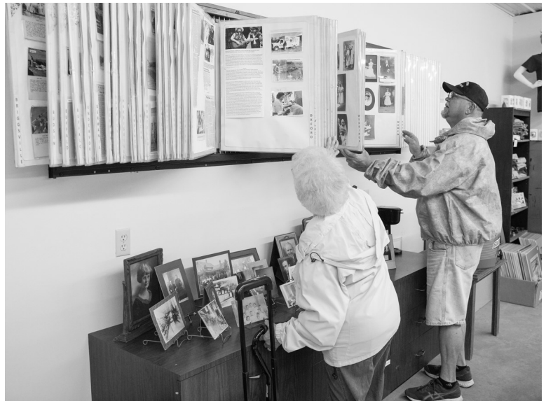
Perusing photos at the historical society during the Strawberry Sociable.