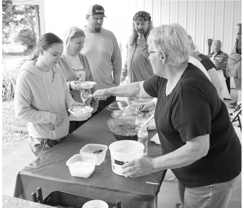
Scoopin' up the ice cream at the Strawberry Sociable

We've been busy at MCHS. Rummage sale, Strawberry Sociable and coming up, the County Fair!