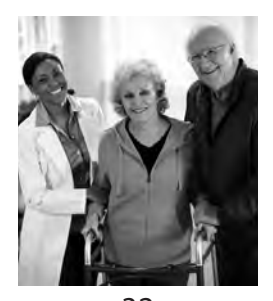
32 For the Caregiver Your role as patient advocate.