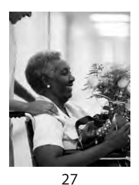
Don't Leave Until... 5 things you should know before you walk out the door.