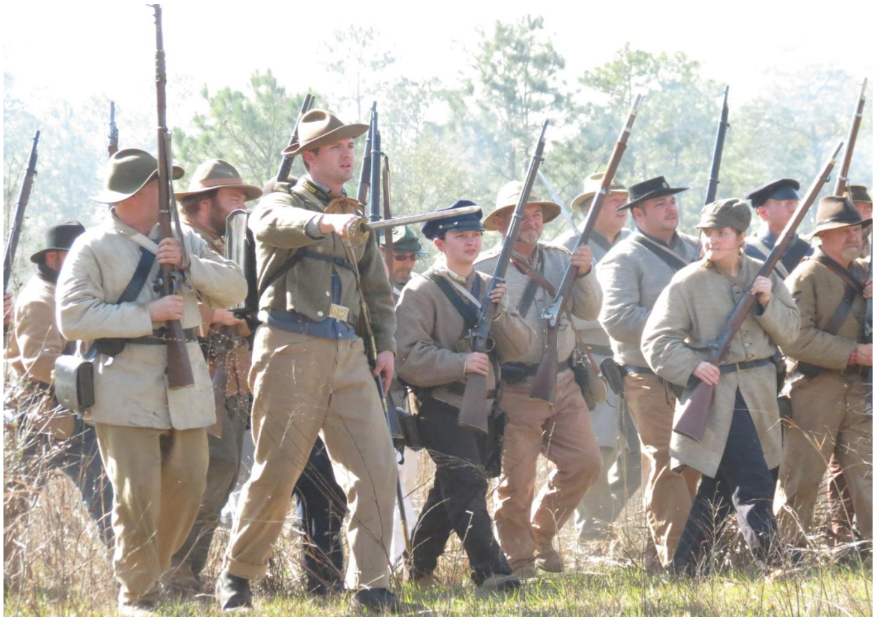
The "Jackson Rifles" Surge Forward at the Battle of Ocean Pond