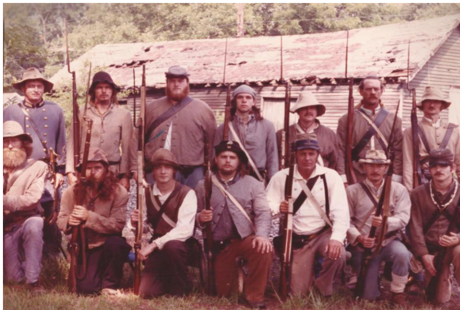
The 16th Georgia Co. G - Byron, GA - Summer 1990