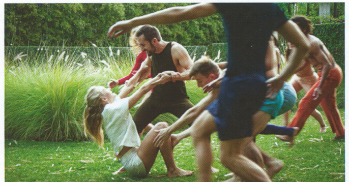
Members of the L.A. Dance Project.