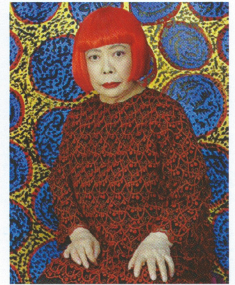
Yayoi Kusama, 2013

For more information on any of the Glass House's May events and exhibits, or to discover the world of Philip Johnson that awaits you at this magnificent venue please visit www.theglasshouse.org