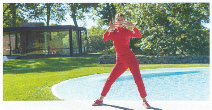
Ivy Baldwin Dance