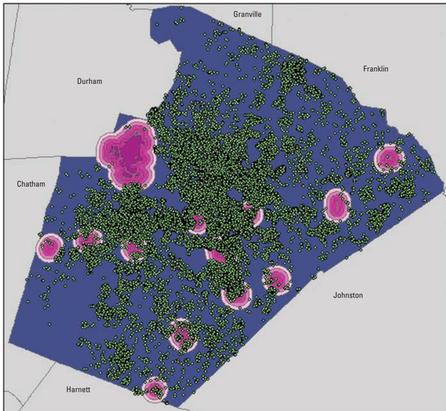
Figure 2. Airports buffered at distances of 500 m, 1,000 m, 1,500 m, and 2,000 m in Wake County, North Carolina, plotted along with a jittered representation of the residential addresses of the children screened for blood lead.