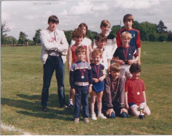
Line-up of the winners