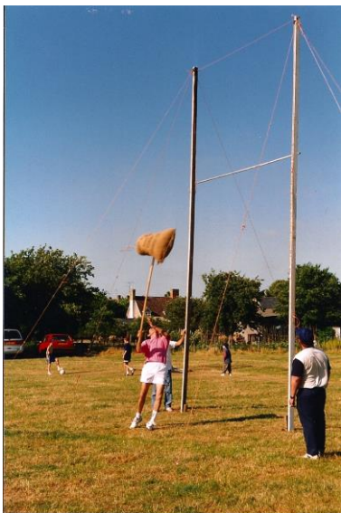
Tossing the bale