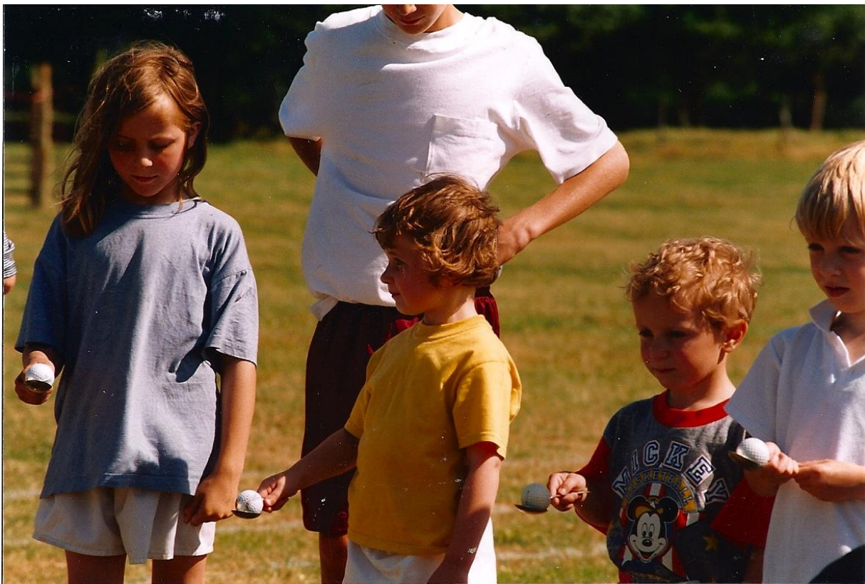
Egg & spoon race