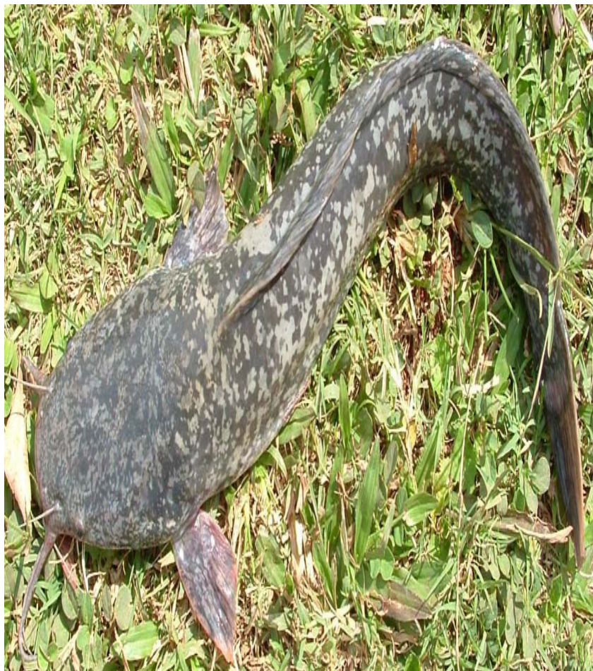
FIG 2: Pictorial Presentation of Clarias gariepinus