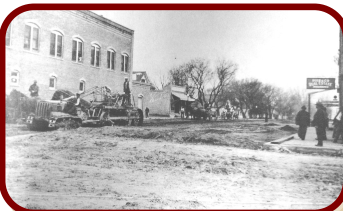
Picture taken at 10th Street around March 1930 by what is now the Chamber of Commerce Office.

June 26, 1929: An ordinance creating a paving district. With a proposal to pave Lake Avenue from the depot to the Library and one block each way from Lake Avenue on 9th and 10th Streets, has been passed by the City Council.