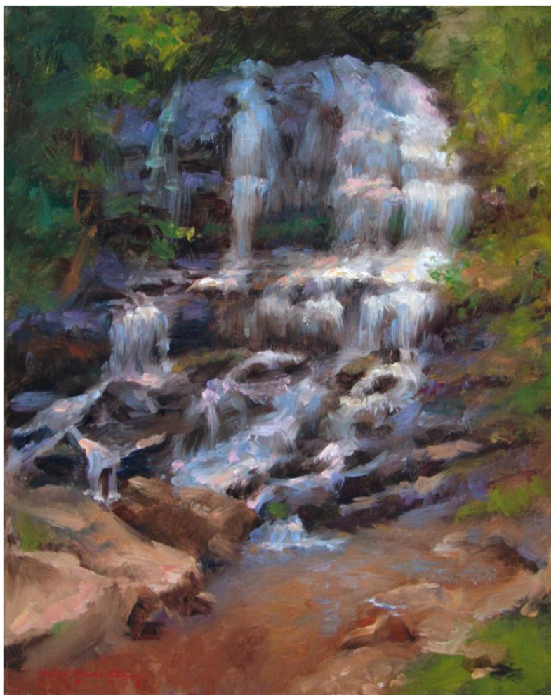
1 Rich Nelson

SEEN AT THE GALLERY IN NOVEMBER AND DECEMBER