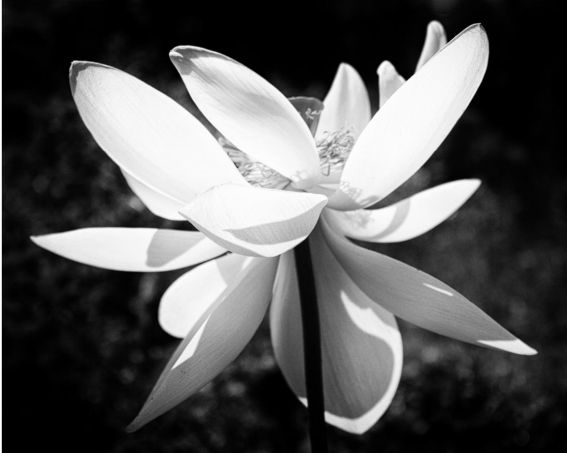
6 Douglas Chamberlain