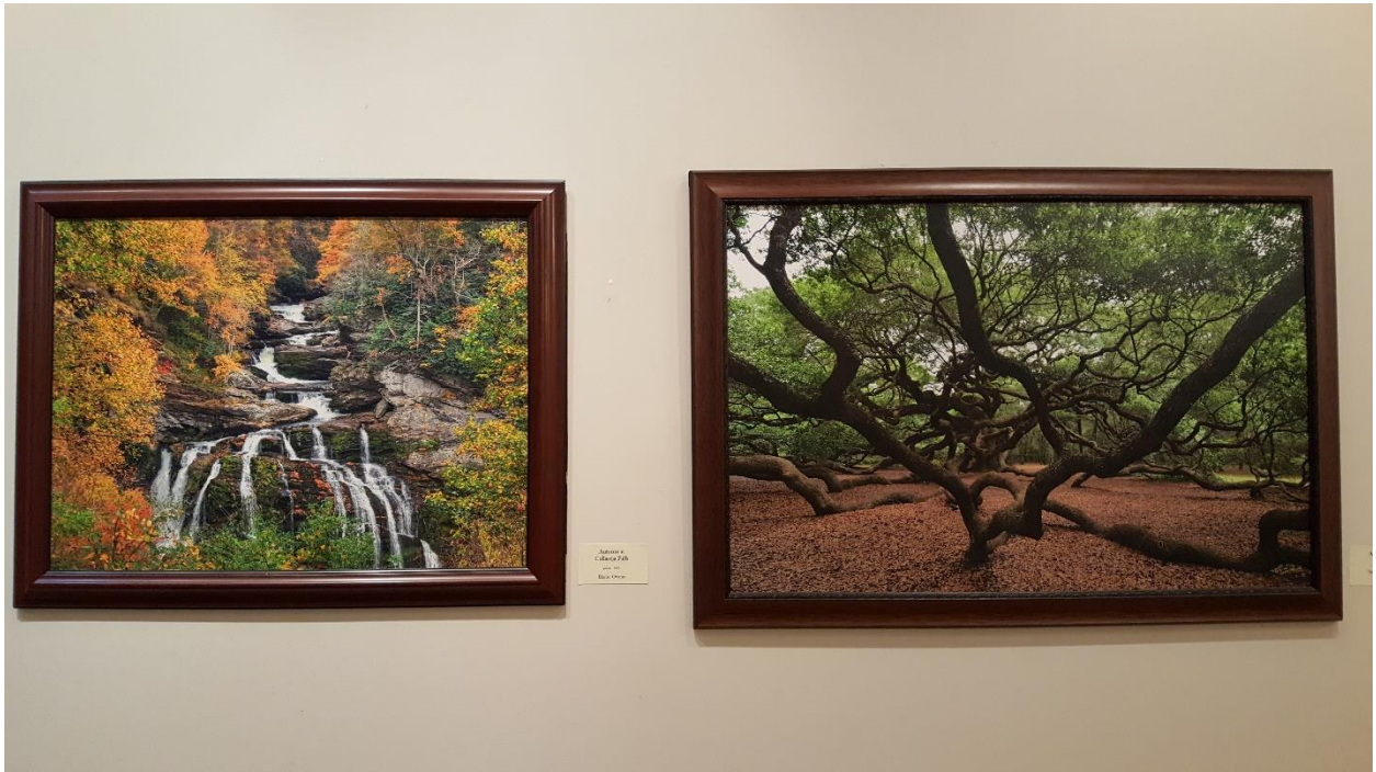
2 Blaine Owens