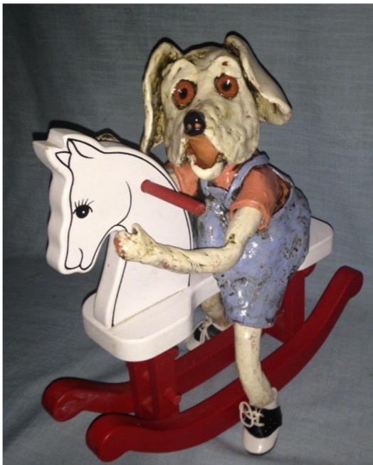
7 Susie Welsh Hearn