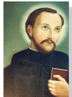
Feast Day: October 19

St. Jean de Brebeuf was canonized in 1930, along with seven other Jesuit martyrs of North America.