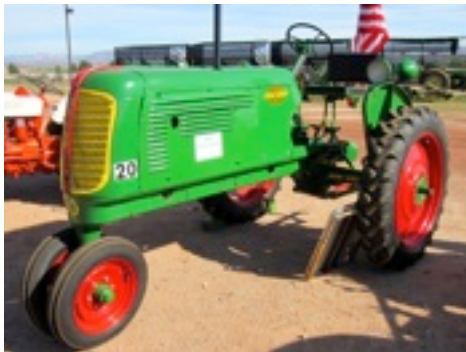
OLIVER ROW CROP