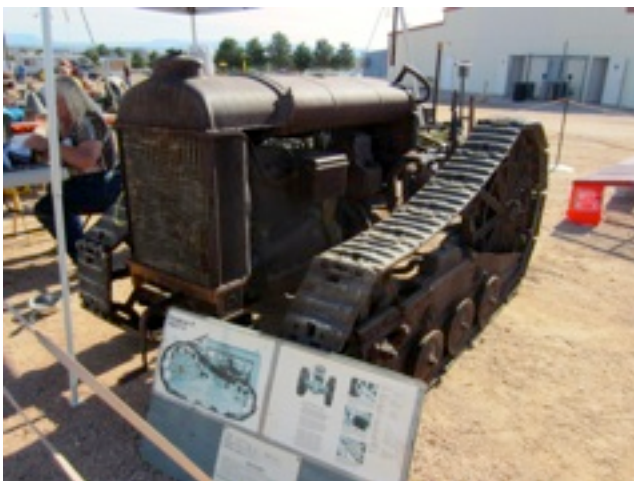
FORDSON F 1927-28