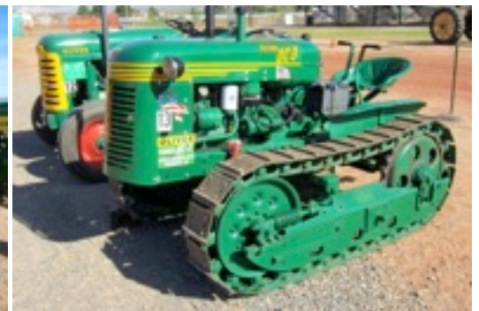
OLIVER OC 3