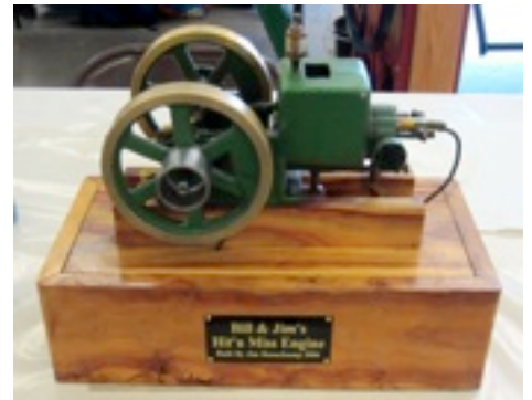
MODEL HIT &amp; MISS