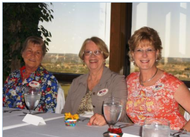
The ladies enjoyed a luncheon at the Pinnacle Grill