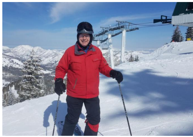
Brighton March 2018