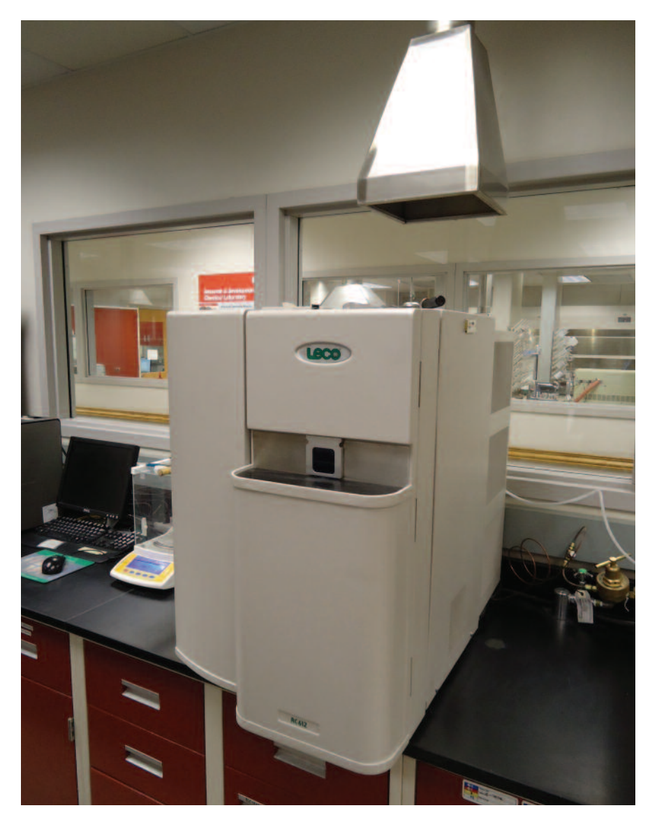
Lincoln Electric's laboratory includes a scanning electron microscopy (SEM), gas chromatograph, and a carbon/sulfur analyzer for substrate carbon detection.

to 5/s-inch thick. In-house receiving of metals includes coils, sheets, bar, and tube stock. Lincoln Electric, unlike most manufacturers of metal finished products, has a very elaborate laboratory, including scanning electron microscopy (SEM), gas chromatograph, and a carbon/sulfur analyzer for substrate carbon detection.