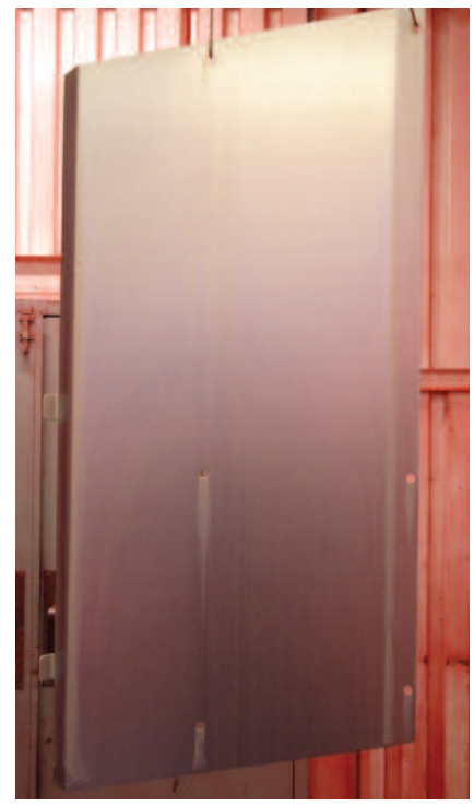
Lincoln Electric powder coats parts in a 1,500,000-square-foot manufacturing plant, operating three 8-hour shifts, 6 days a week. The part in the photo is pretreated with the new transition metal conversion.

Supplier selection. Based on the criteria, the team chose Circle-Prosco, Bloomington, Ind., for the first trial run. Its TMC process was placed in the production line that produces the famous Lincoln