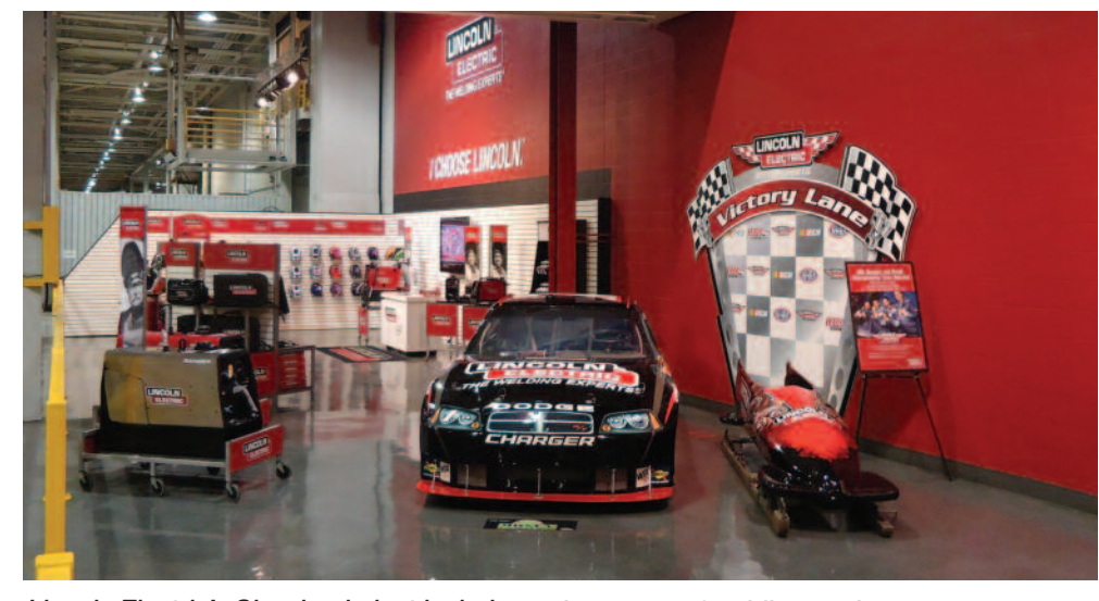
Lincoln Electric's Cleveland plant includes a showroom of welding equipment and company sponsors.

Lincoln's product line of welders ranges from home-owners' units to oil pipeline automated systems for OD and ID welding. For home/agricultural models to industrial models, the company basically offers two versions, standard and heavy duty. The heavy-duty ones are cathodic epoxy primed and polyurethane powder top coated with stainless steel covers. The standard industrial line consists of a specialty-designed powder with performance standards to meet environments where gaso-