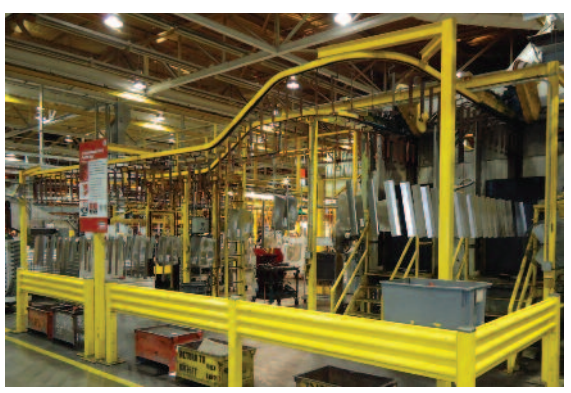
Parts enter the washer system at Lincoln Electric.