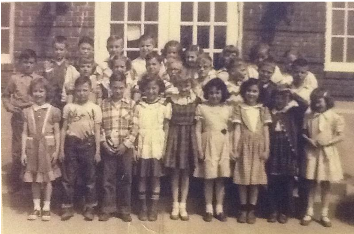
Roosevelt Grade School, 17th & Adams ((S/W Corner) Hutchinson, Ks 67502