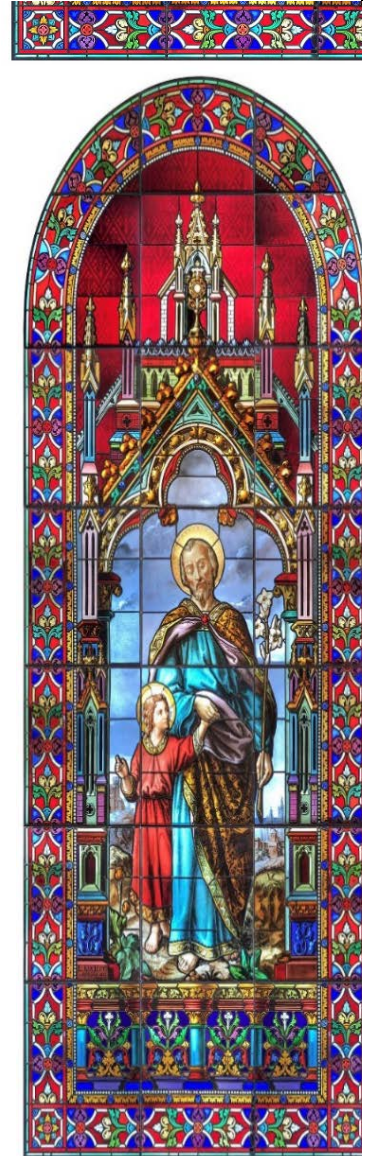
The window depicting St Joseph with the child Jesus, found in the clerestory level in the Basilica-Cathedral of St John the Baptist, St John’s.

The evangelist Luke, for his part, tells us that Joseph undertook the long and difficult journey from Nazareth to Bethlehem to be registered in his family’s town of origin in the census of the Emperor Caesar Augustus. There Jesus was born (cf. Lk 2:7 ) and his birth, like that of every other child, was recorded in the registry of the Empire. Saint Luke is especially concerned to tell us that Jesus’ parents observed all the prescriptions of the Law: the rites of the circumcision of Jesus, the purification of Mary after childbirth, the offering of the firstborn to God (cf. 2:21-24 ).