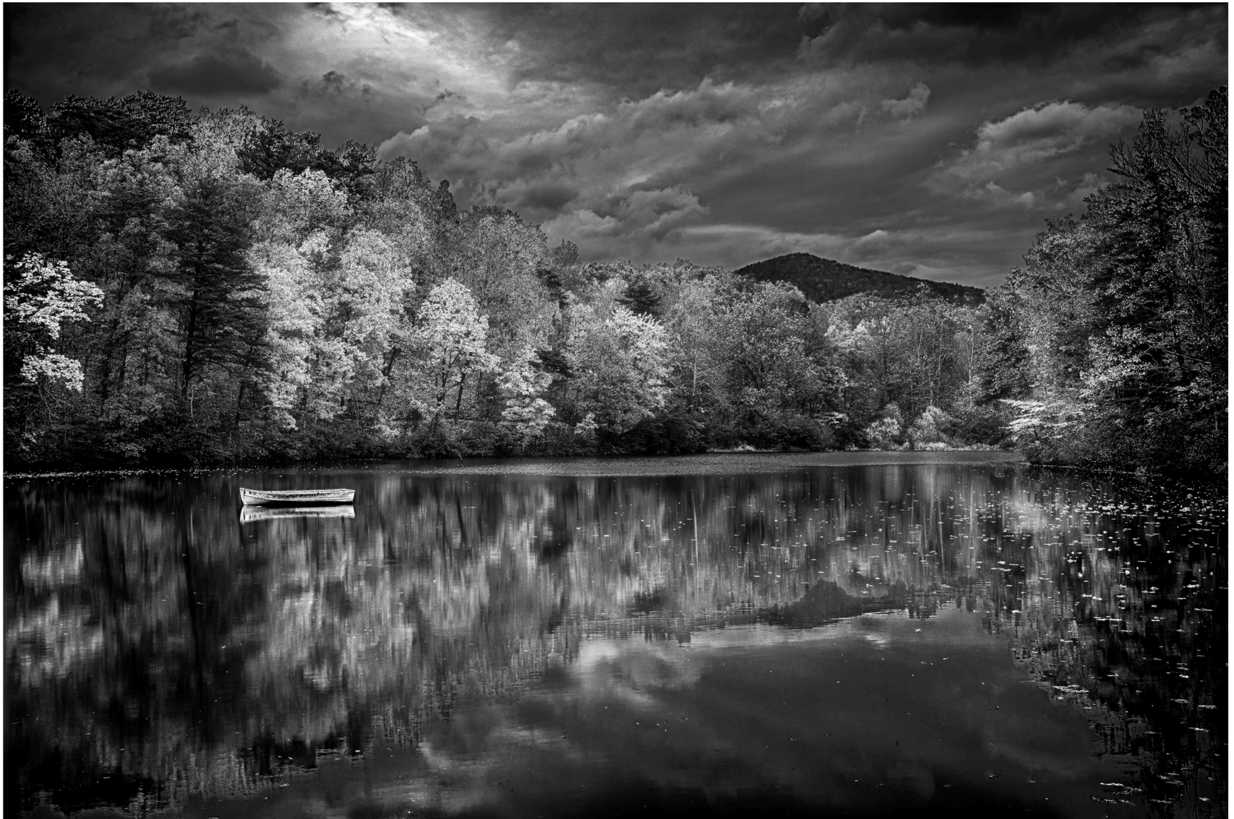
Entry - 11