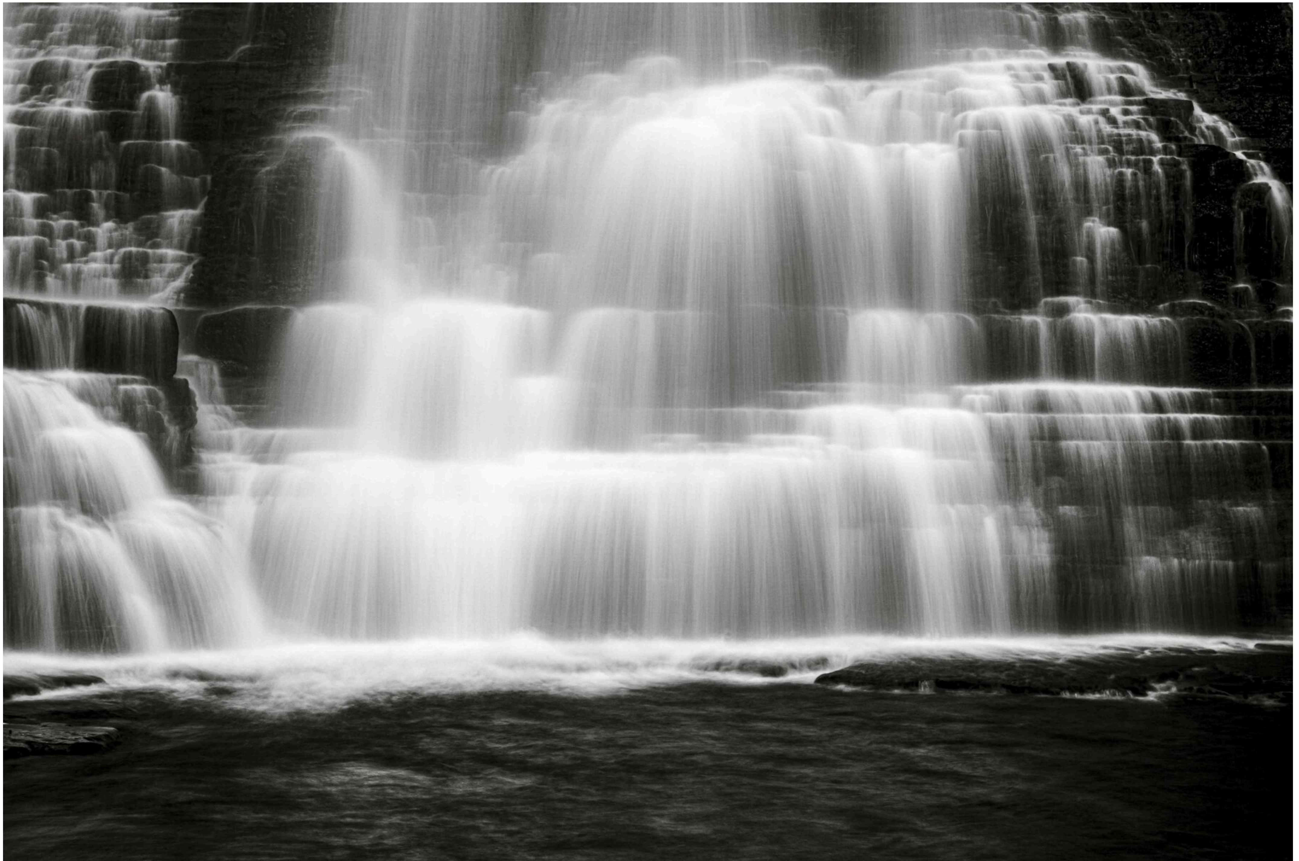
Entry - 4