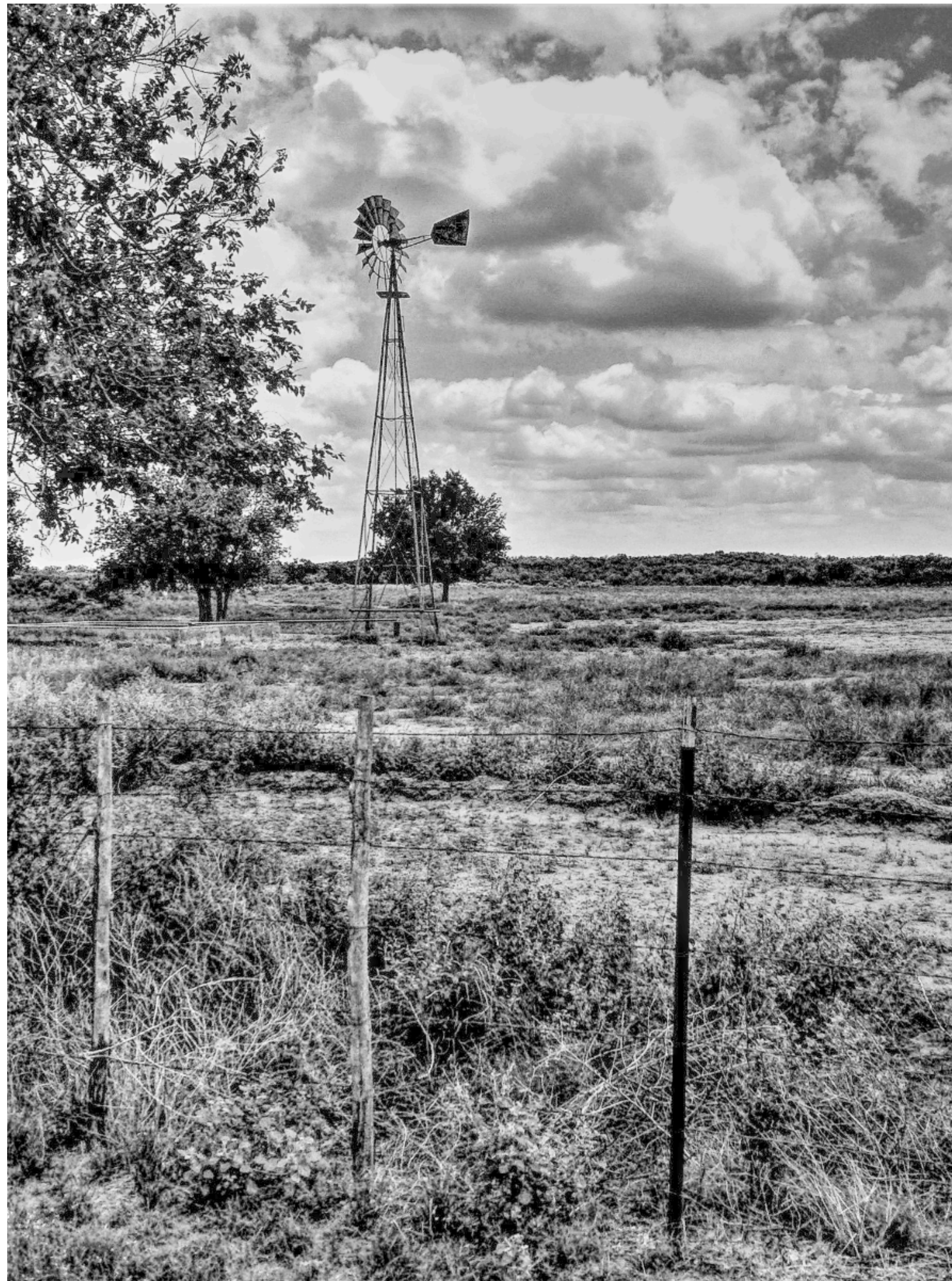
Entry - 13