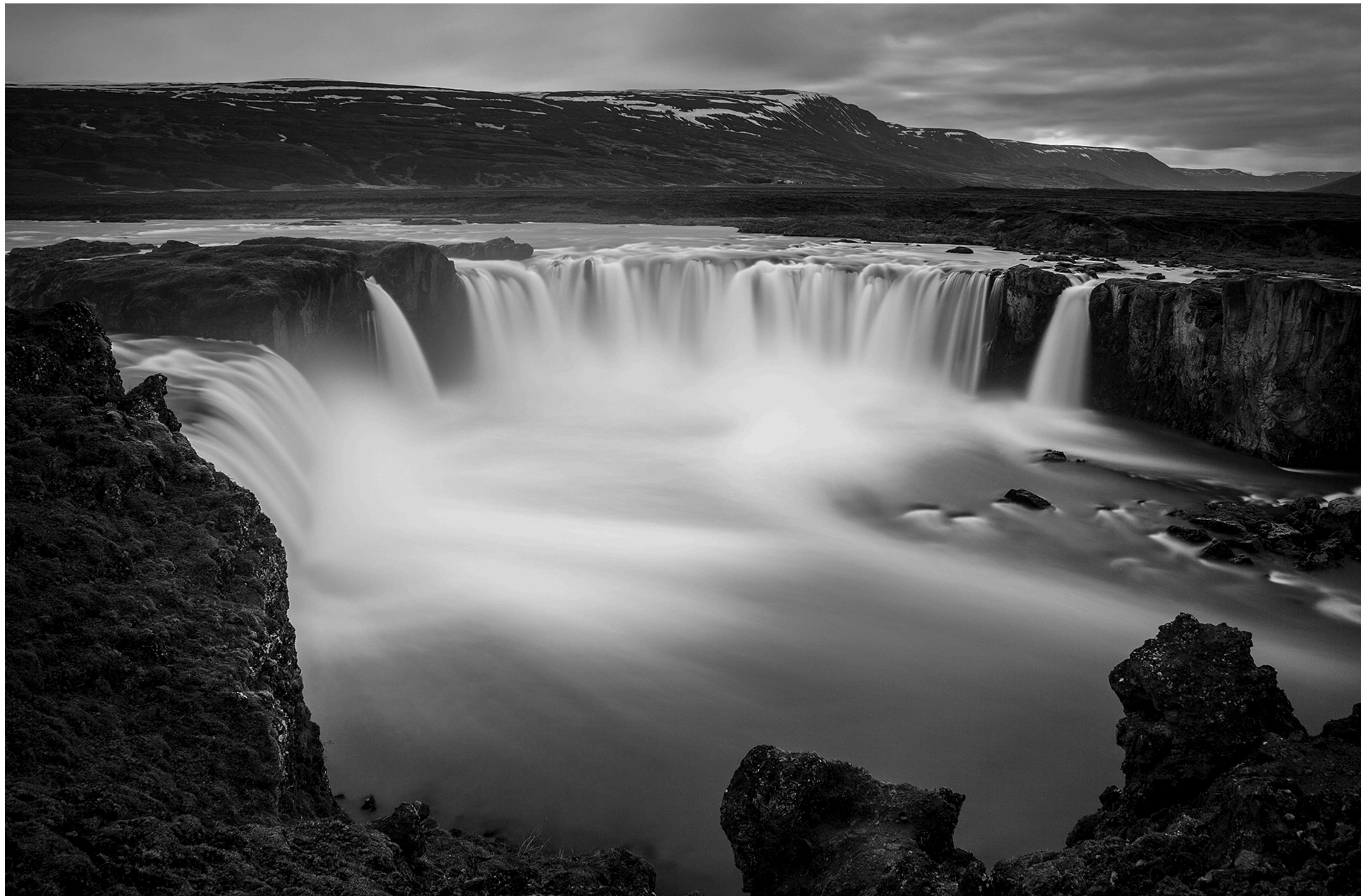
Entry - 14