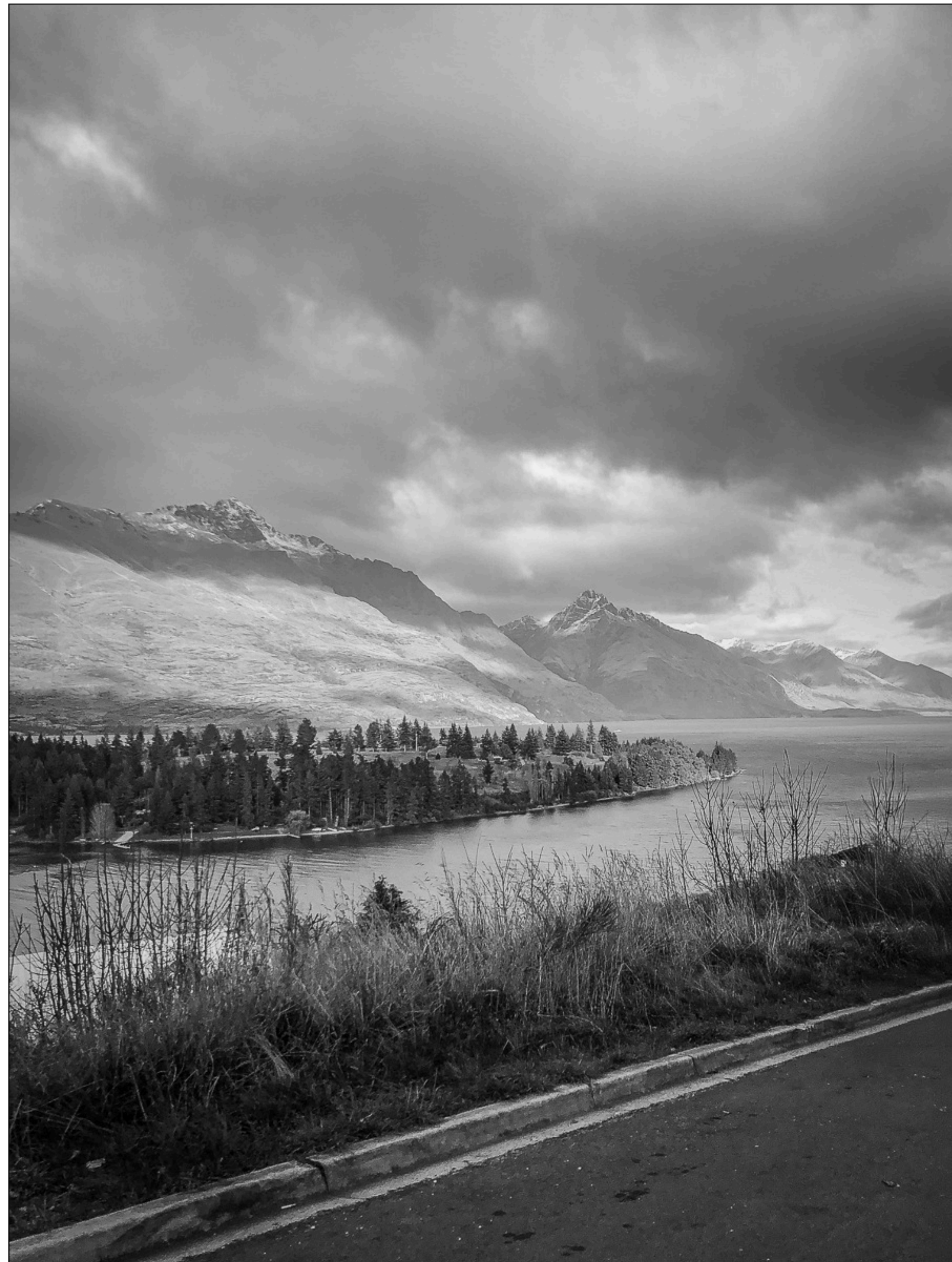
Entry - 3