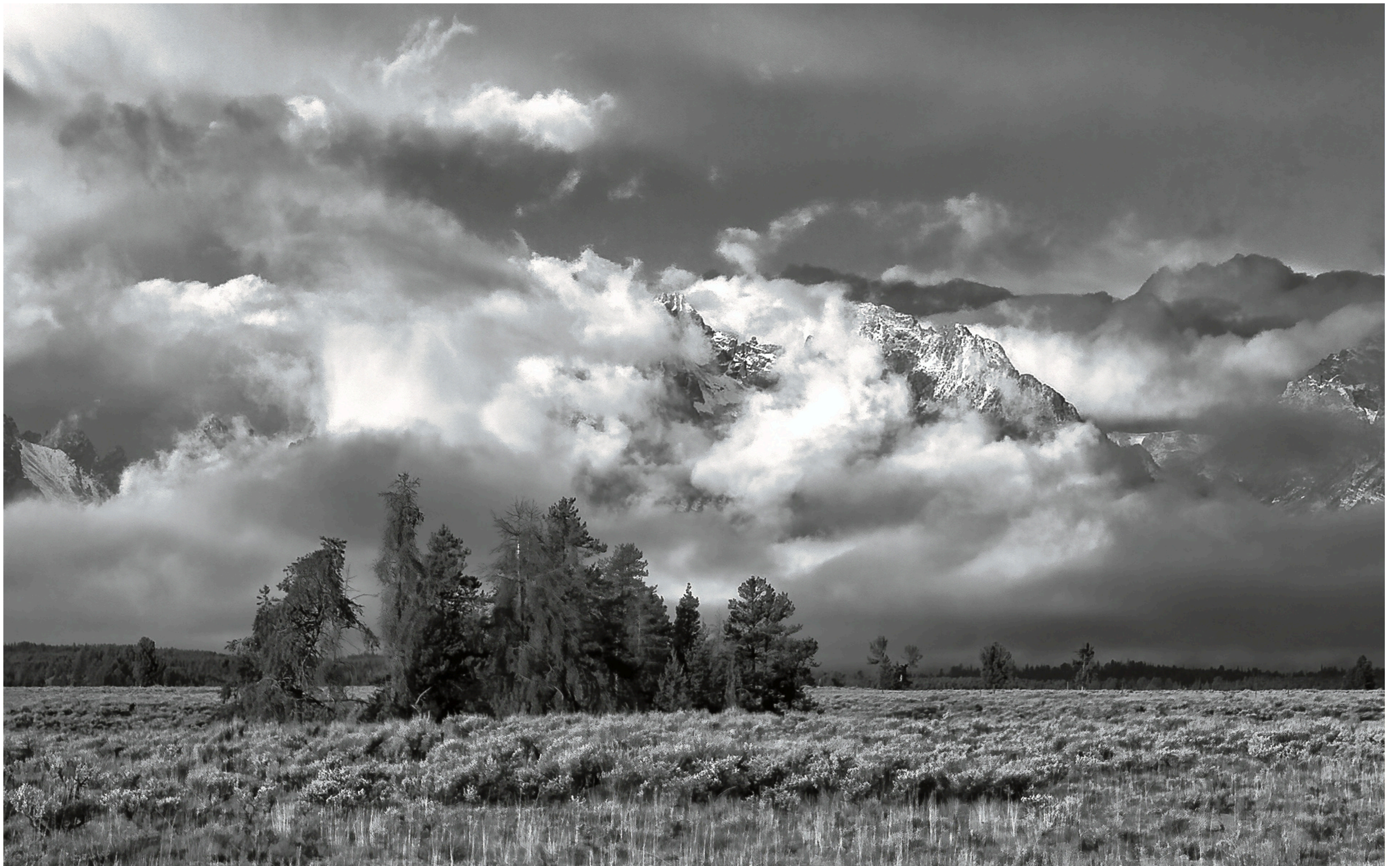
Entry - 1