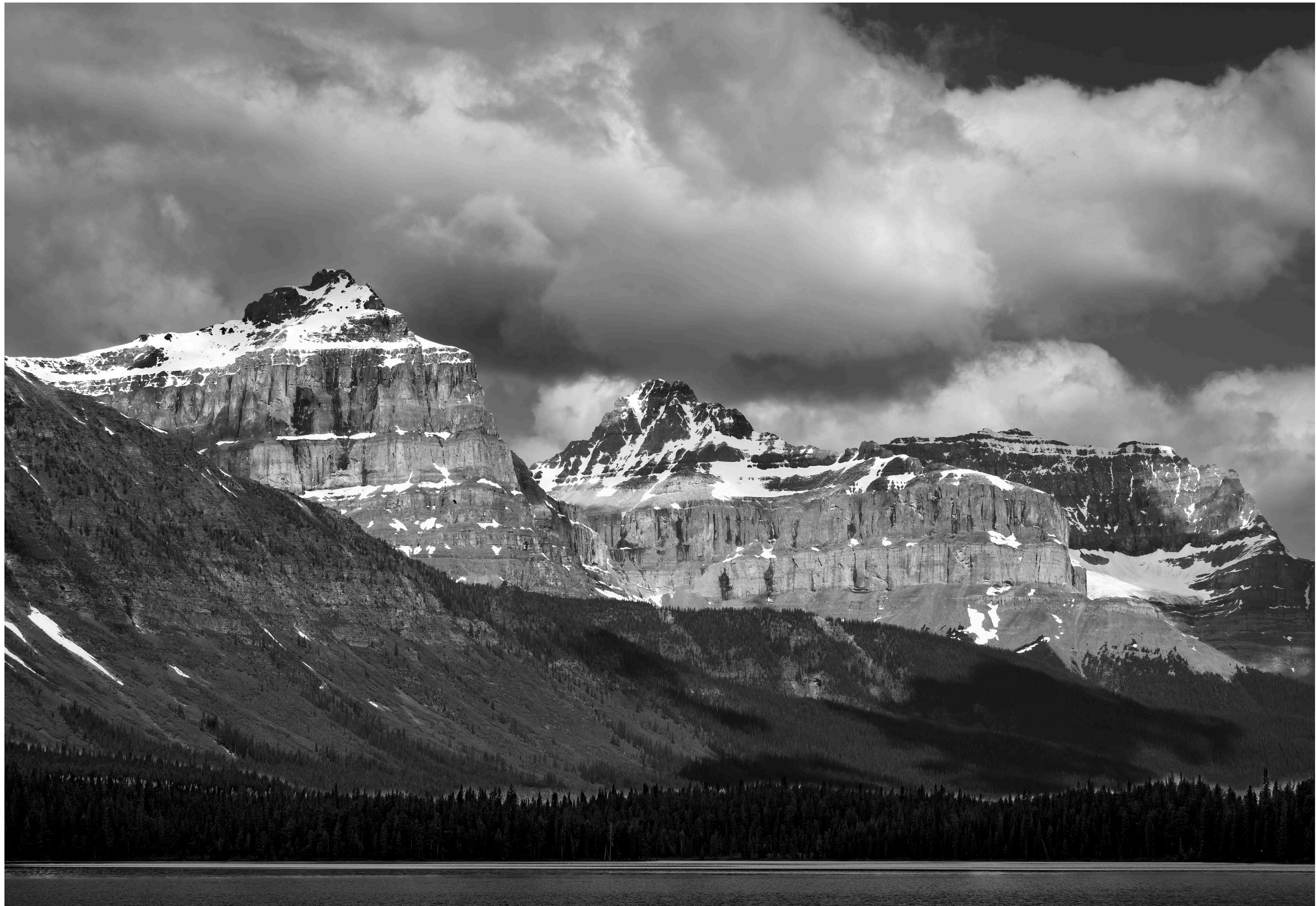
Entry - 17