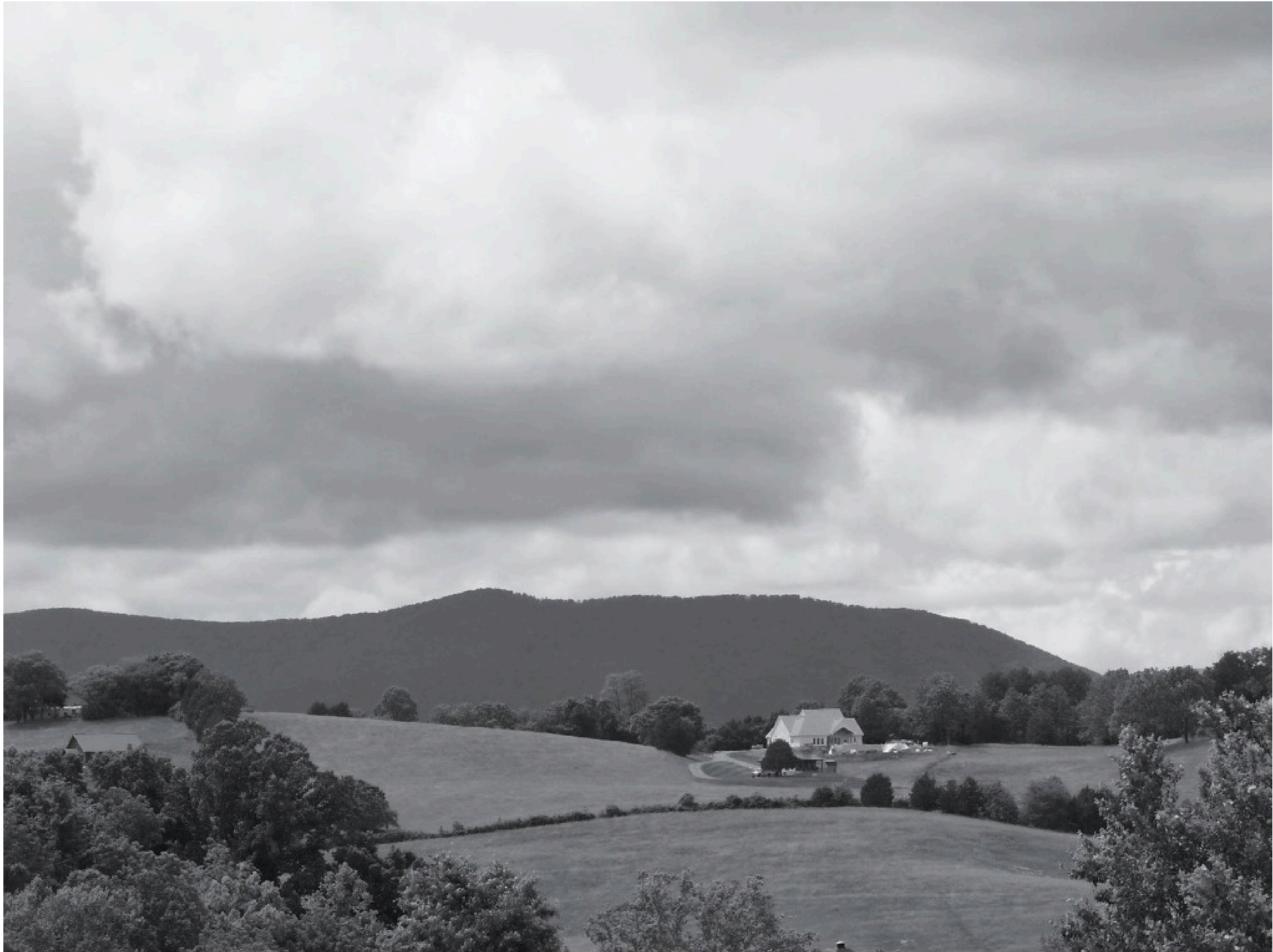
Entry - 20