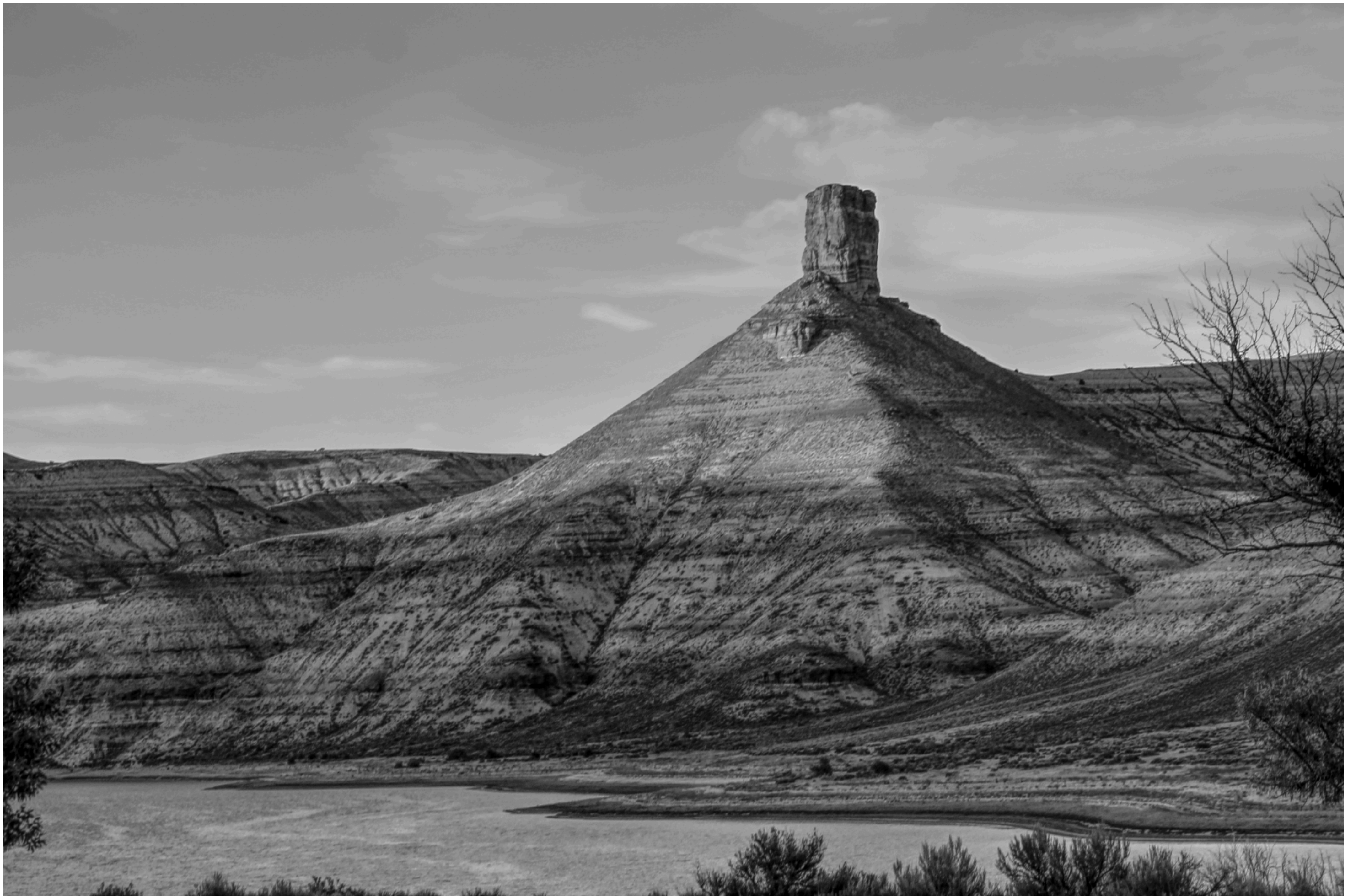
Entry - 10