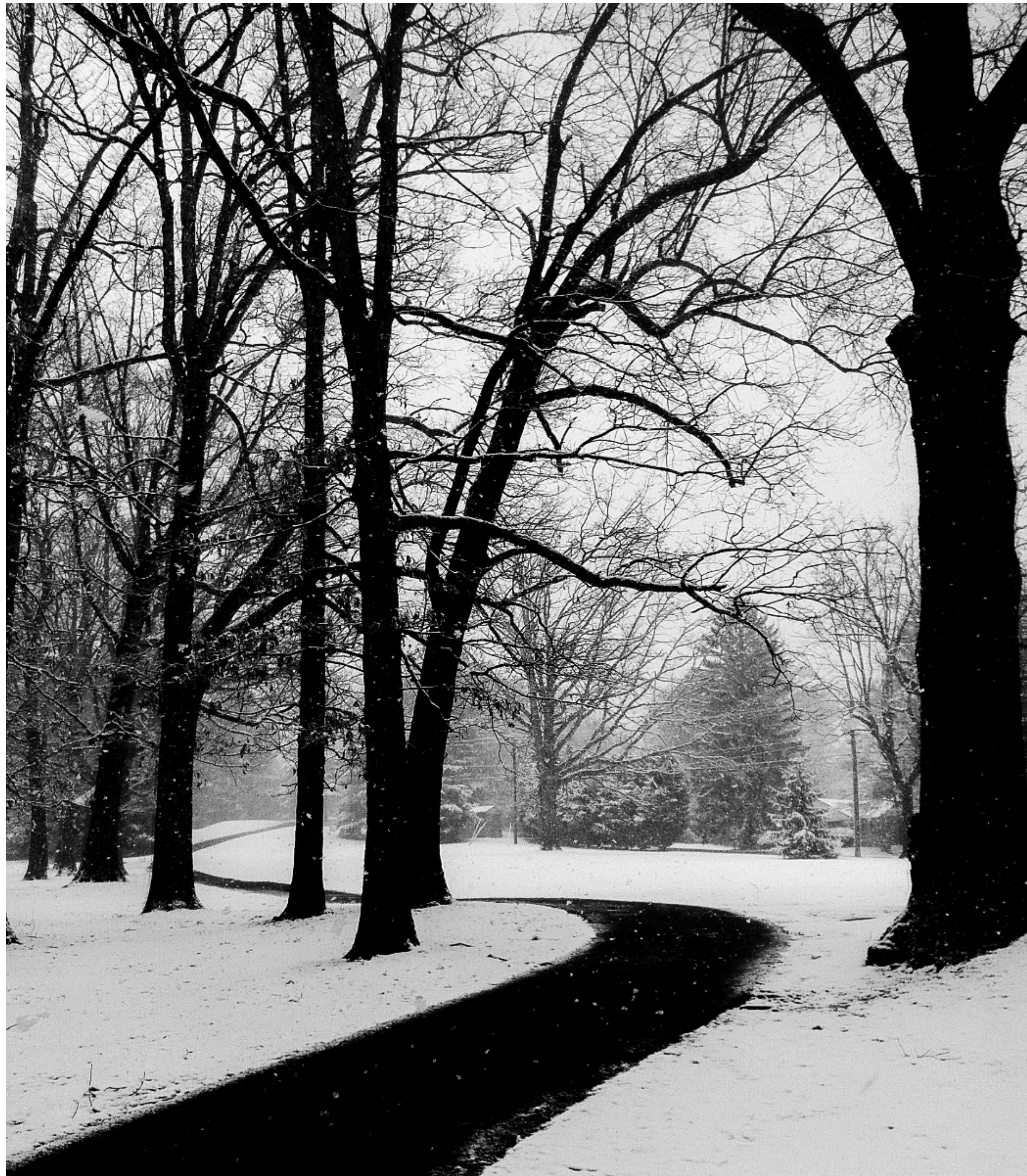
Entry - 8