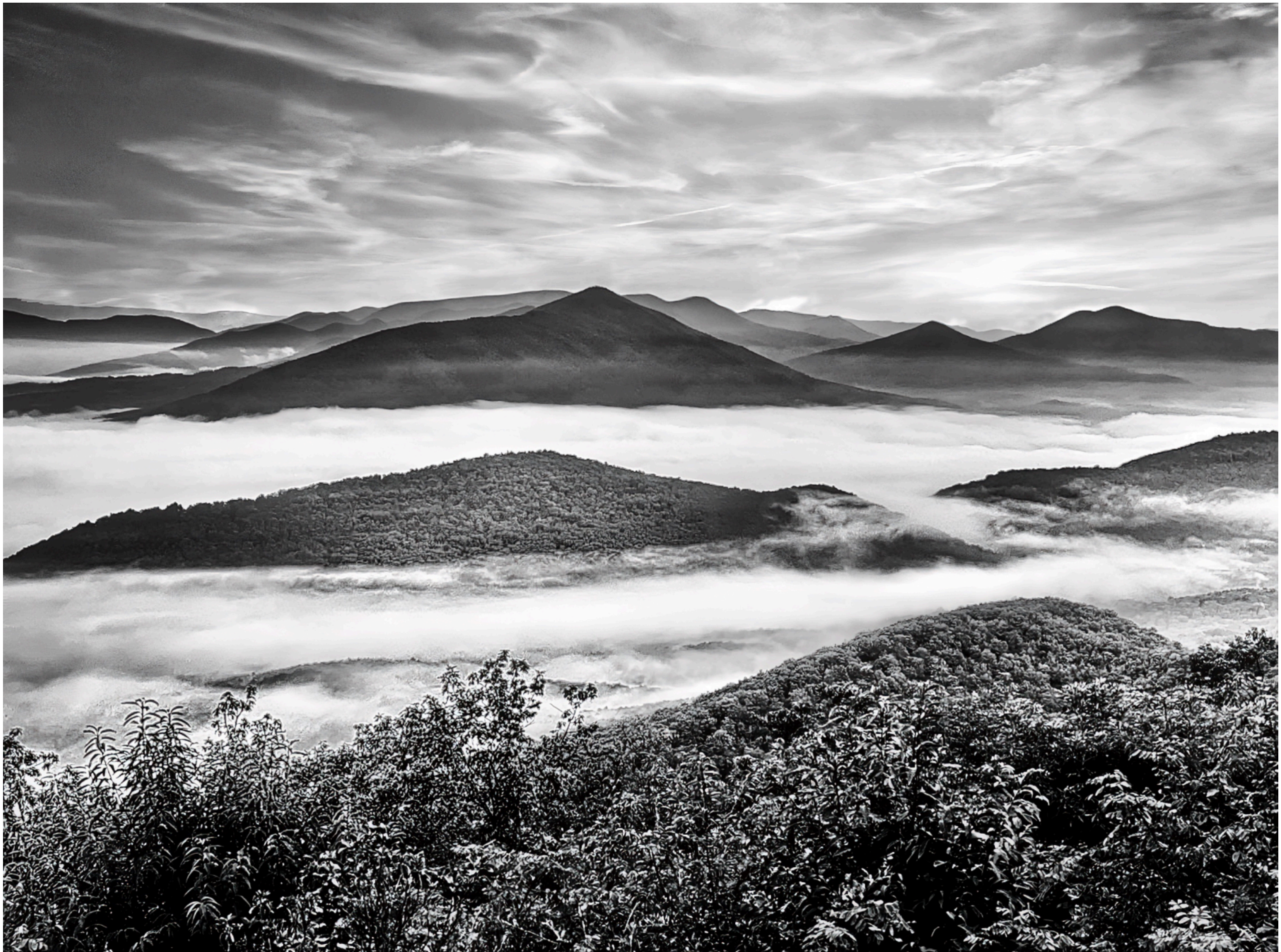
Entry - 5