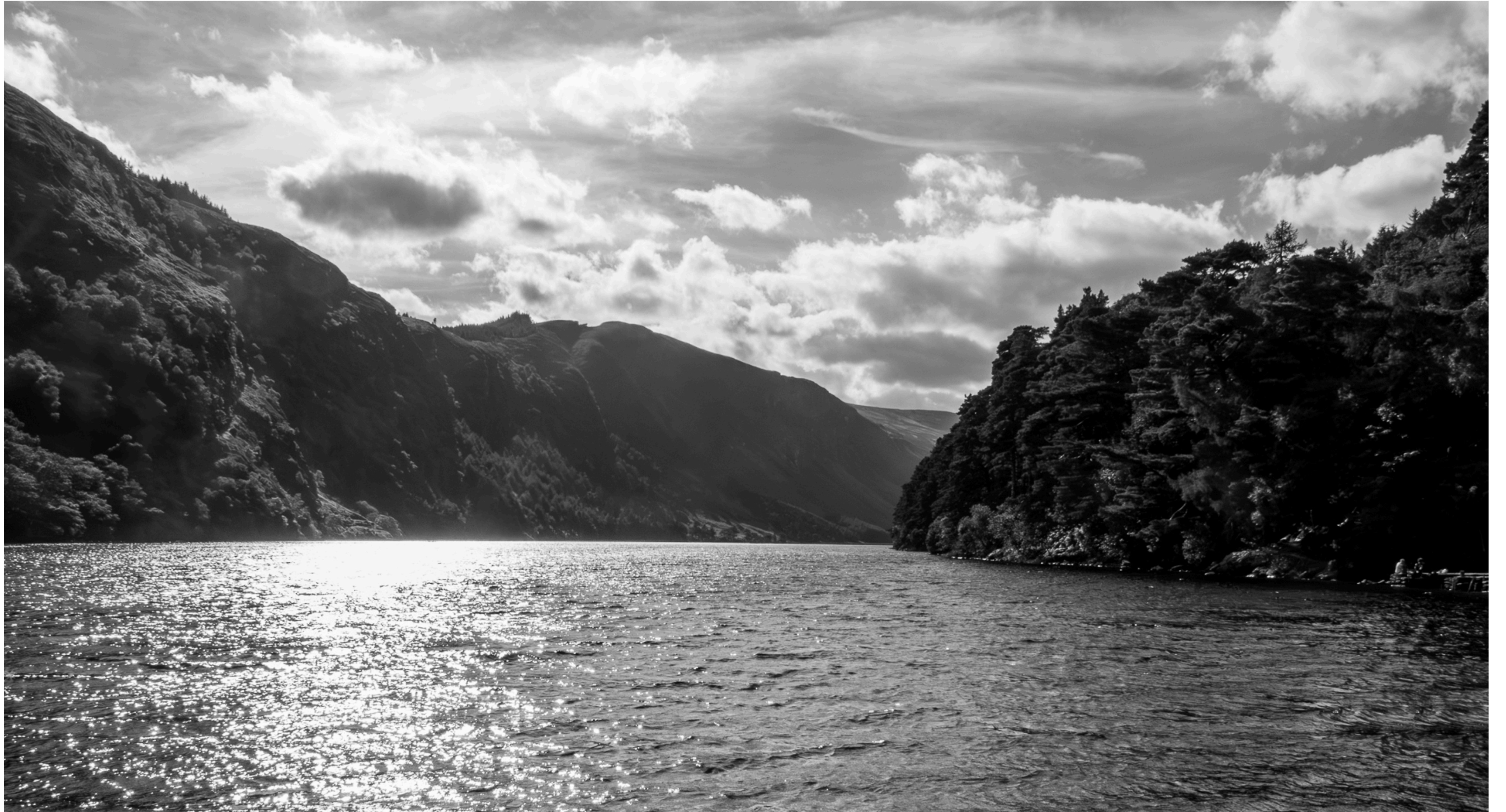
Entry - 21