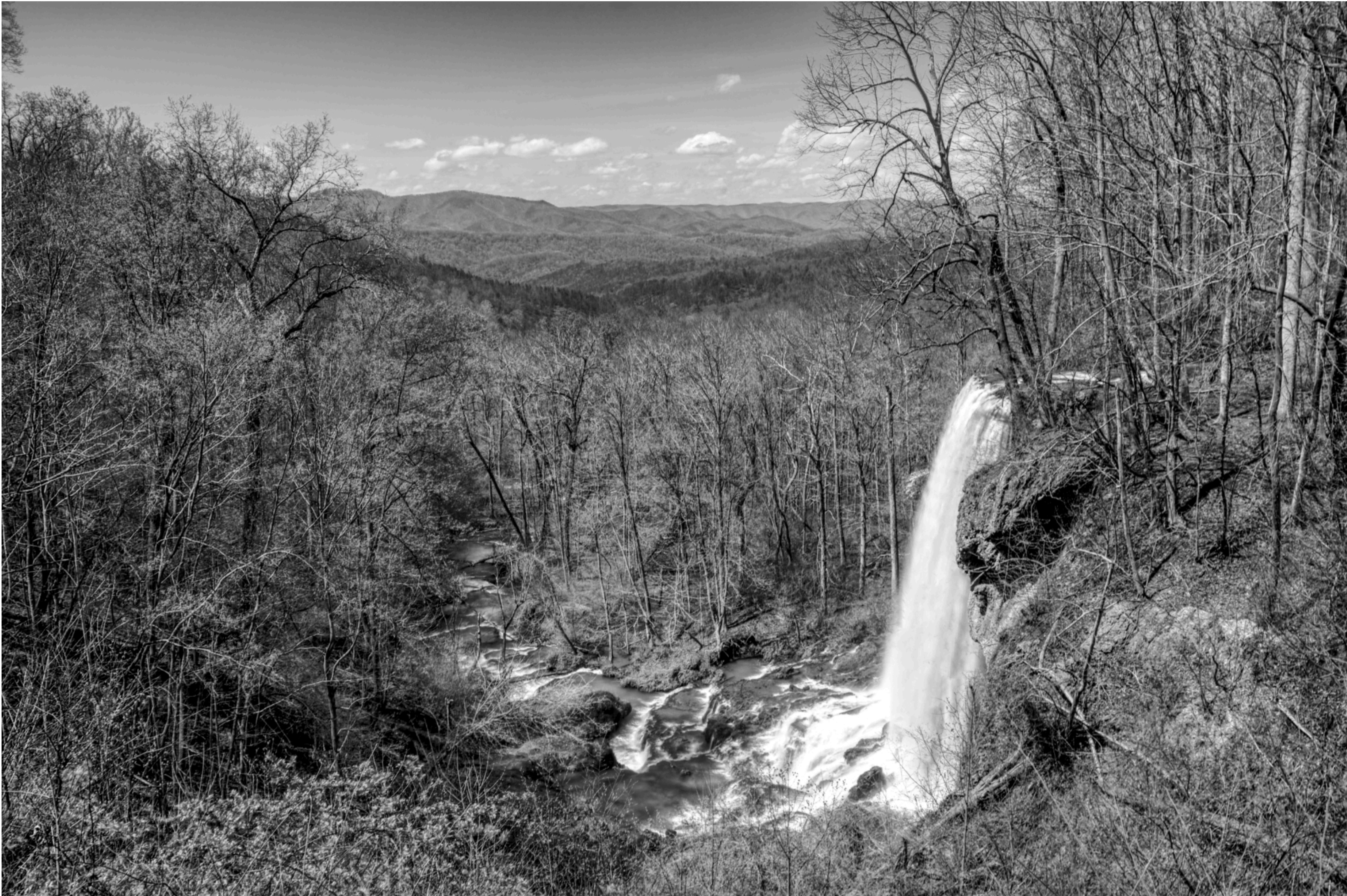
Entry - 2