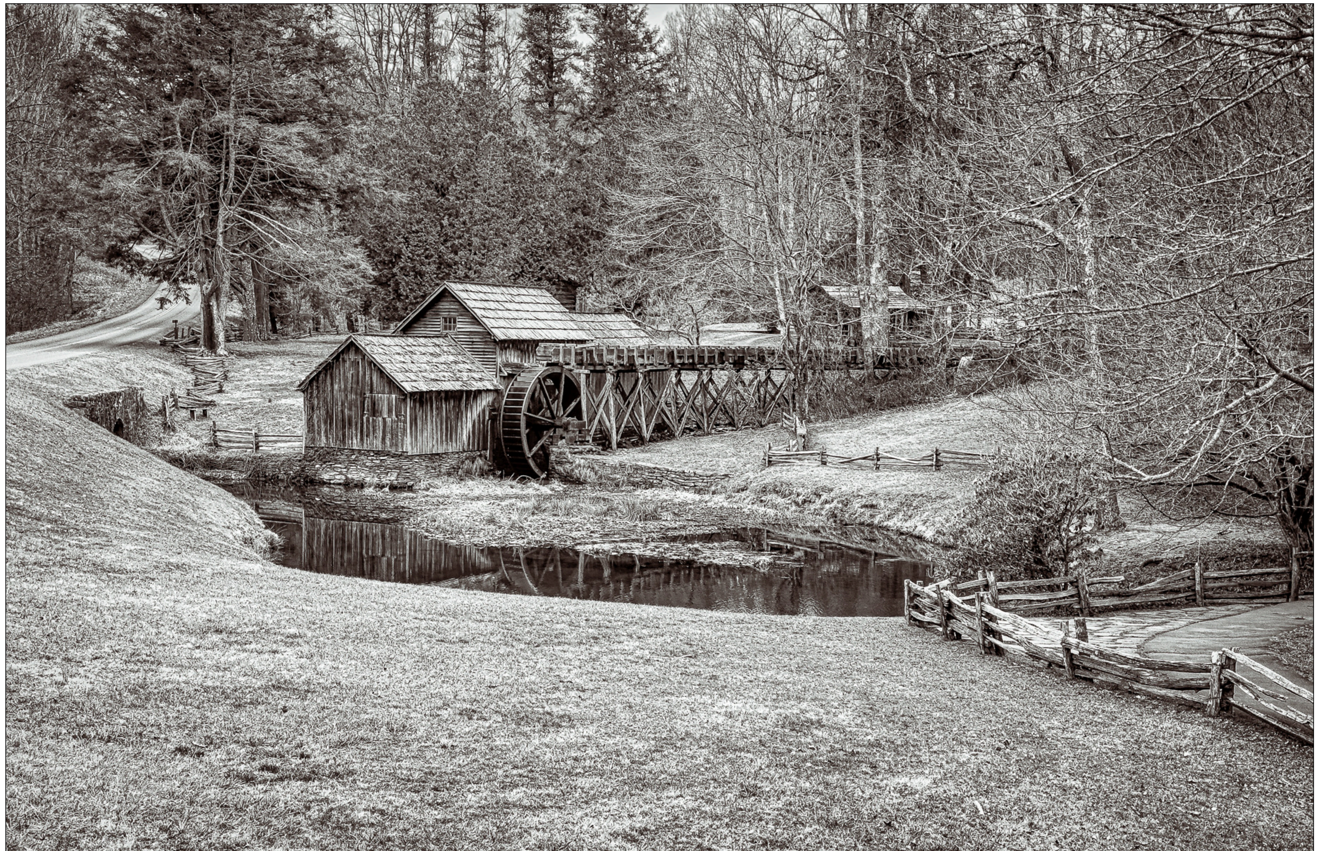
Entry - 16