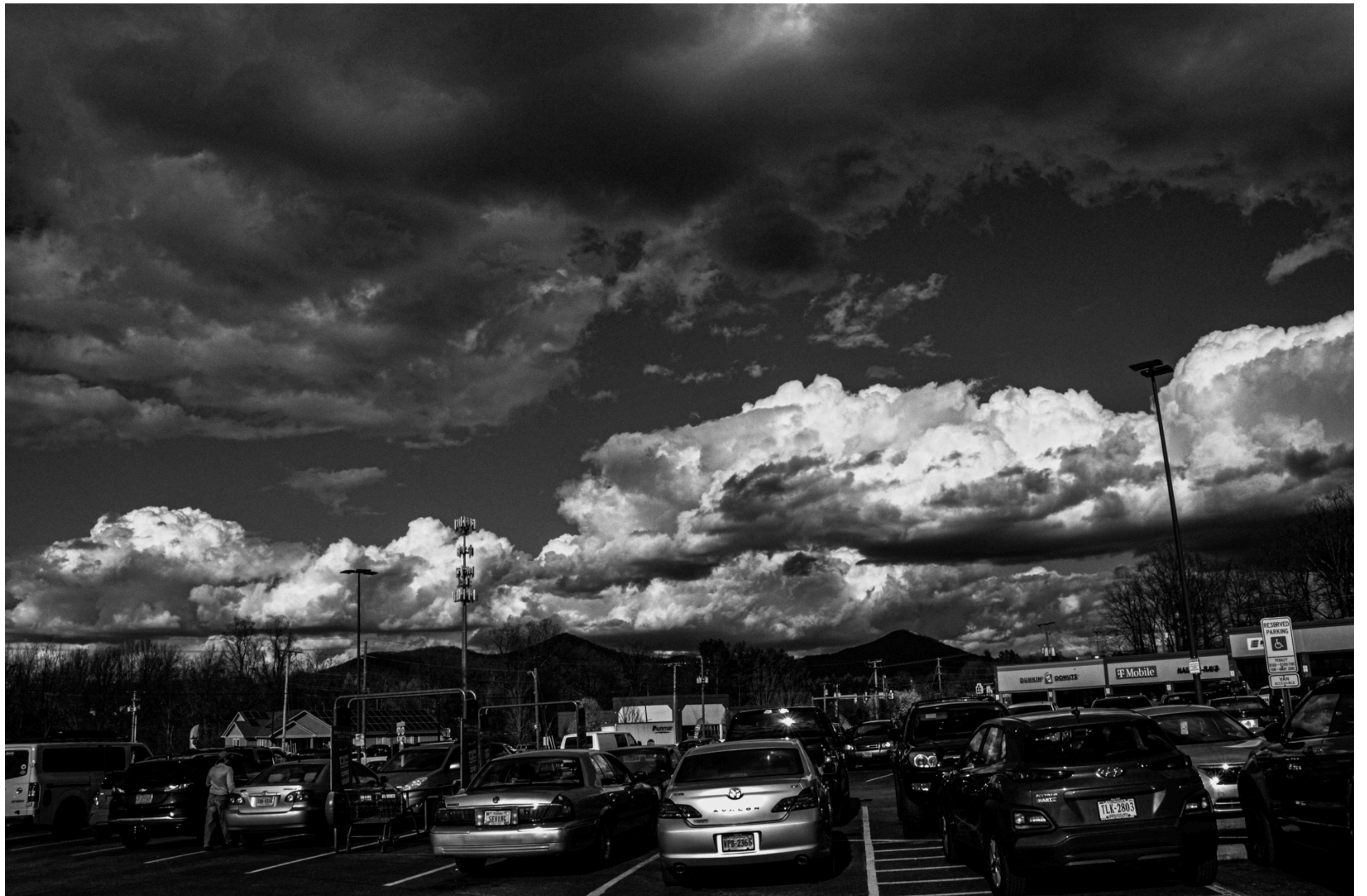
Entry - 12