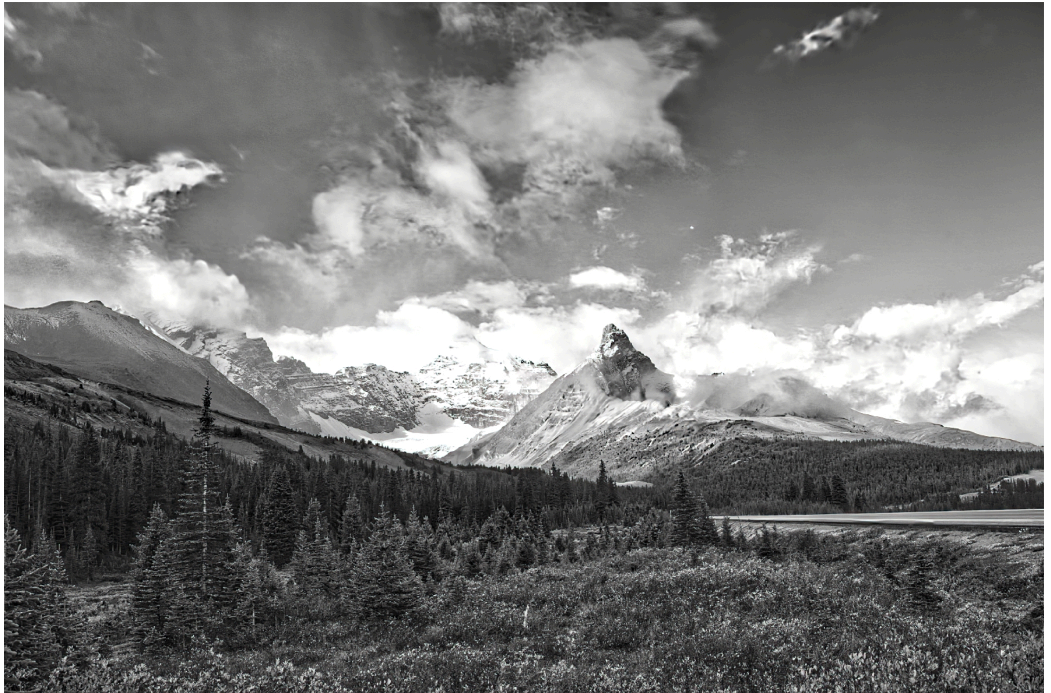
Entry - 9