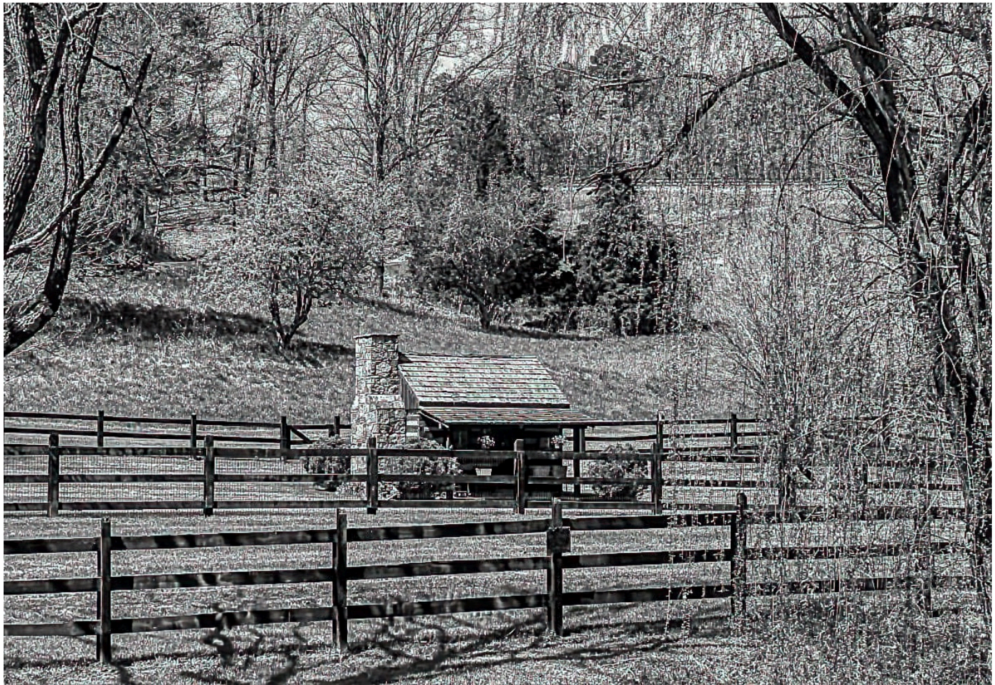
Entry - 7