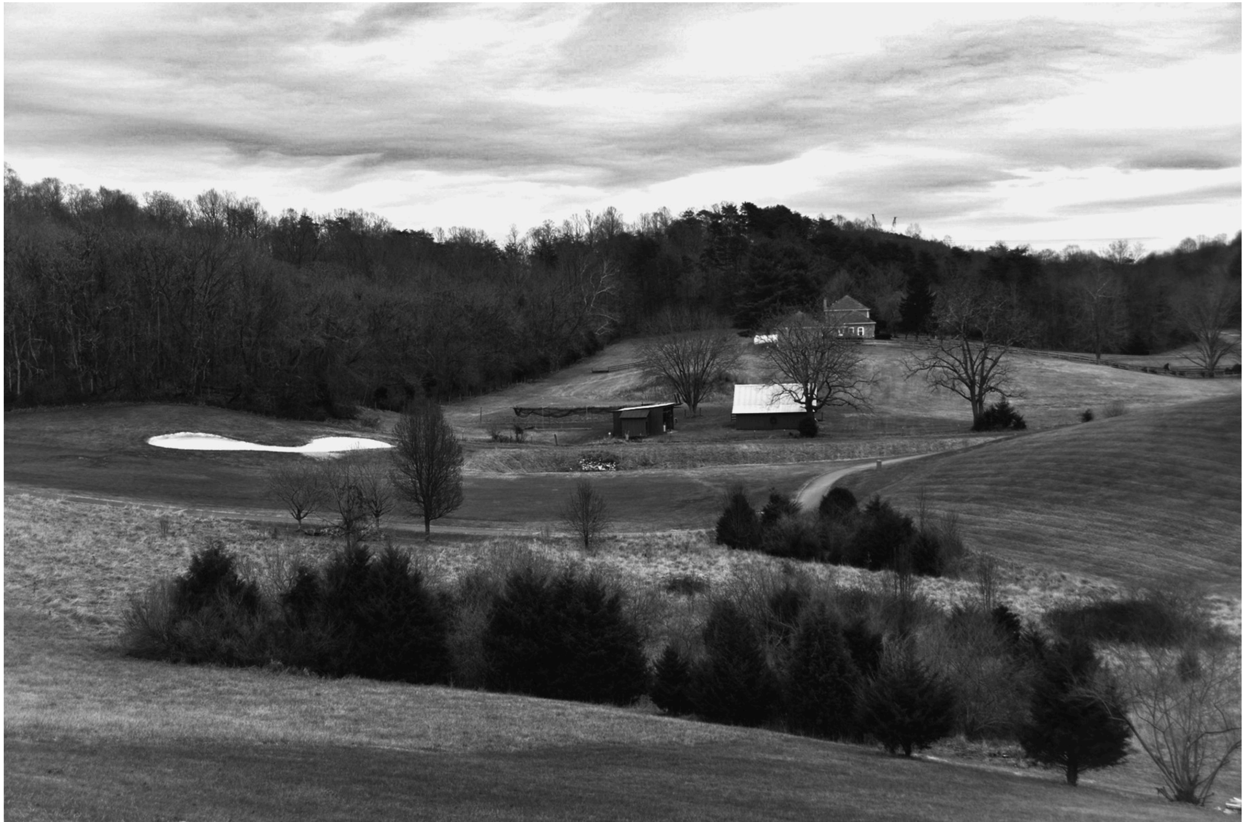
Entry - 18