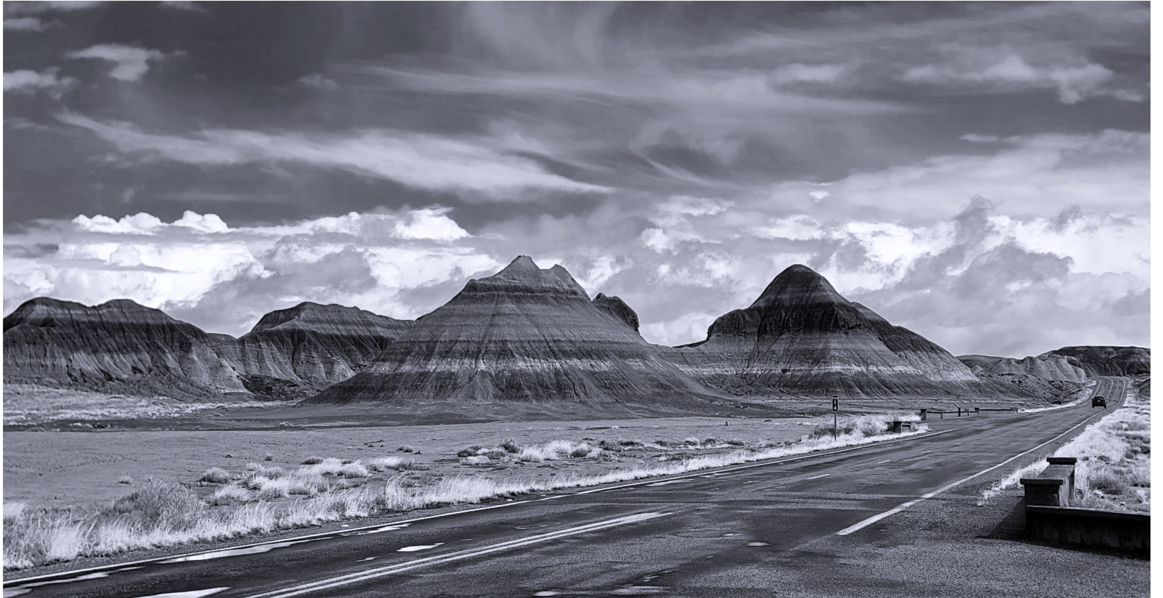
Entry - 6