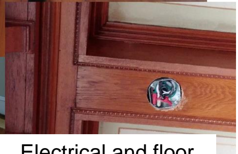
Electrical and floor work