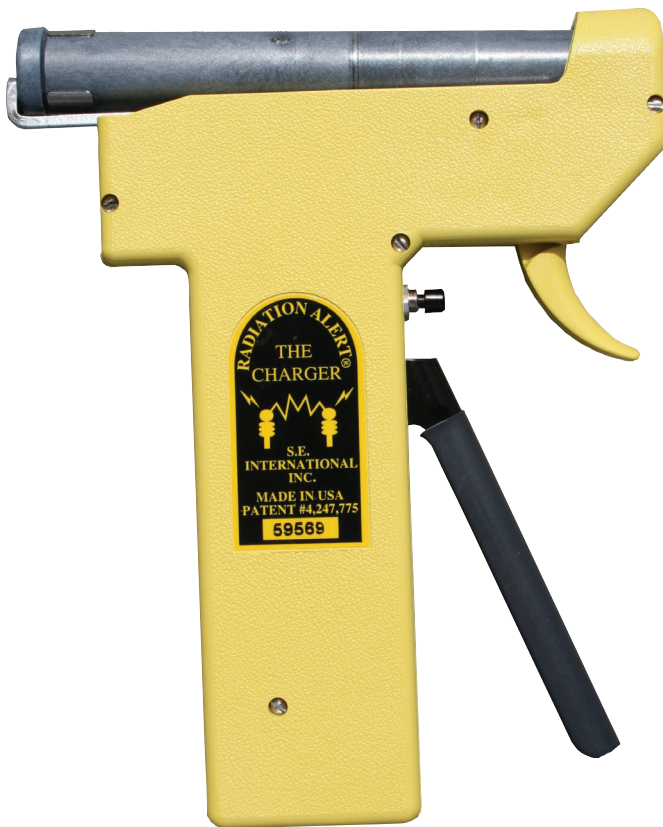
The Radiation Alert ® Dosimeter Charger (Shown Above) can recharge Pen Dosimeters without batteries