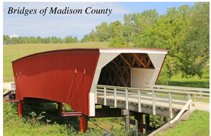
Bridges of Madison County

After breakfast we’ll depart to the “Netherlands” and become Dutch for a day in the blooming & charming village of Pella, Iowa where windmills, tulips, and excitement welcomes visitors to the colorful Tulip Festival. Pella is filled with the sights, tastes, and sounds reminiscent of Holland. Enjoy the Molengracht (Dutch Marketplace) for shopping and the special festivities of Tulip Time. From Reserved Seating, we’ll view the Volks Parade, featuring the street scrubbers, beautiful floats, the Royal Court, Dutch dancers and more! After departing Pella, “ America’s Dutch Treasure ”, we’ll have a short distance to the Prairie Meadows Casino & Hotel in Altoona, Iowa. The opportunity is yours for relaxation, enjoying the cuisine at the hotel’s restaurant, or visiting the adjacent casino if you feel lucky!