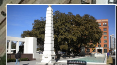
The exact site of the Kill Shot is in φ ratio to the Obelisk that later would commemorate the event in bronze plaques.

From the 'Dark' Tower, if you project several headings in degrees, to the 'capstone pyramid', you end up with some amazing and hidden esoteric and occultic/satanic repeating numbers. They are as always, a factor or 33, 96, 32, 13, 22, etc. Each has its own meaning and reason for usage in influencing people & places. These numbers are sacred in the scheme of witchcraft used to gain supernatural demonic powers by those that are the Masters of the Pyramid.