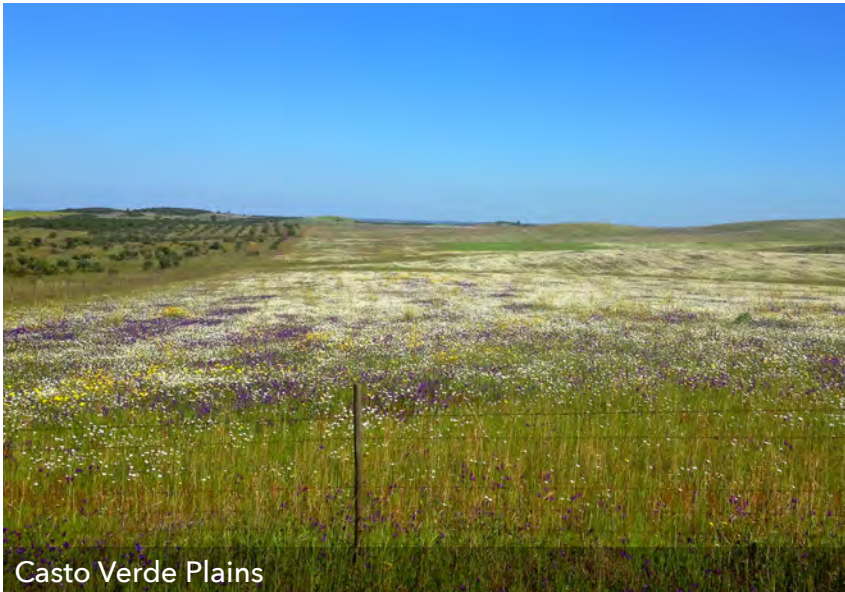
Casto Verde Plains