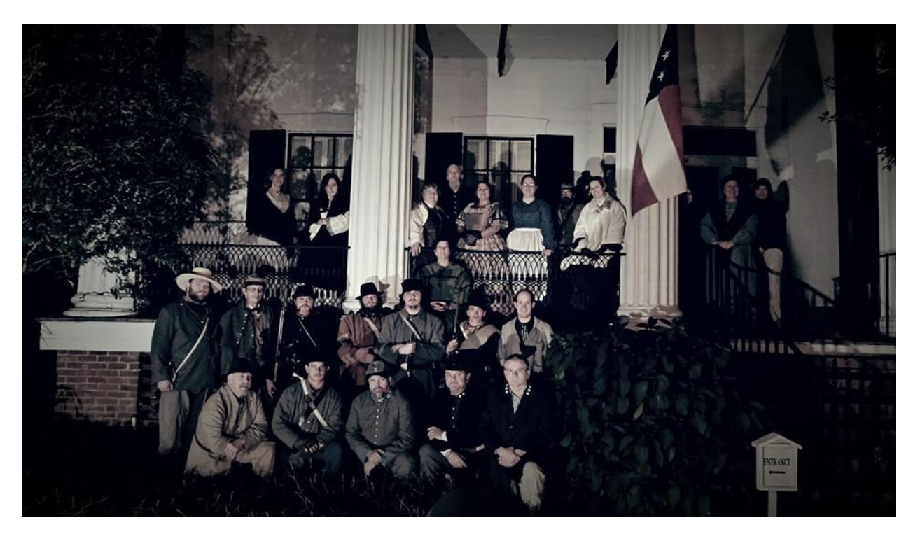
Entire Cast and Crew from the Cannonball House Candlelight Apparitions November 15, 2014, Macon, GA