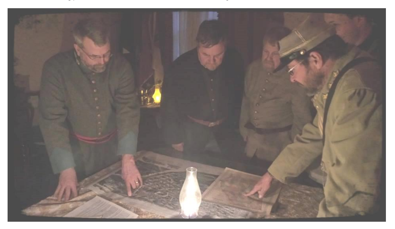
In this scene from Candlelight Apparitions Confederate General Plan Strategy in the face of Sherman's March

The Cannonball House historic site of Macon, GA held its fourth annual performance of Candlelight Apparitions on the evening of November 15, 2014. The re-enacted scenes in the candle lit home comprised a trip back into Macon's past. Capacity tours ran on the hour beginning at 5 p.m.- 7 p.m. Member of The Camp of the Unknown Soldier, #2218 of Old Clinton, Jones County, GA were instrumental in this production.