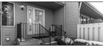
Alexandria • Colonial Acres