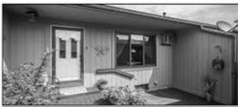
Adams Ct. • Colonial Acres

"We offer a competitive listing fee that we know would excite any seller"