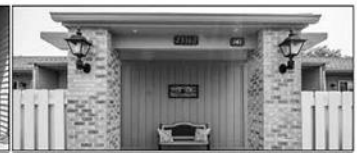
Jefferson Ct. • Colonial Acres