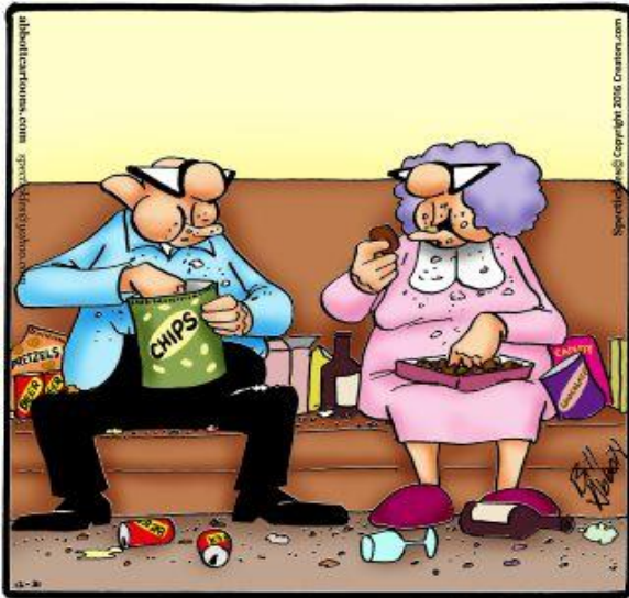
"Hurry! Our New Year's resolutions start in ten minutes."

I DON'T CALL THEM NEW YEAR'S RESOLUTIONS. I PREFER THE TERM: CASUAL PROMISES TO MYSELF THAT I AM UNDER NO LEGAL OBLIGATION TO FULFILL