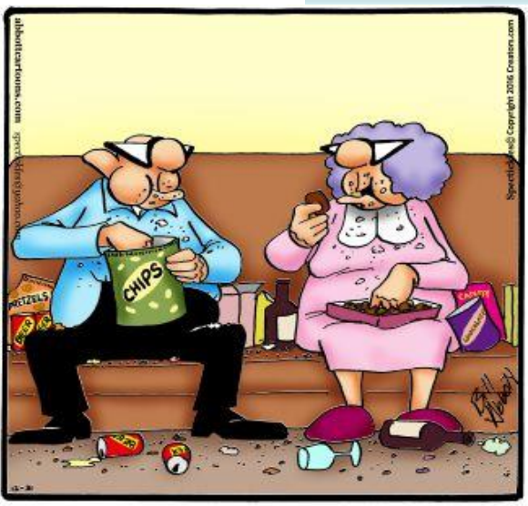
"Hurry! Our New Year's resolutions start in ten minutes."

I PREFER THE TERM: CASUAL PROMISES TO MYSELF THAT I AM UNDER NO LEGAL OBLIGATION TO FULFILL