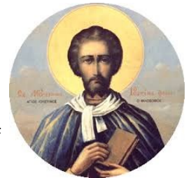
Feast Day: June 1

Justin was born circa 105 AD. He was a Palestinian of Greek parentage, beginning his life in present day Nablus, 40 miles north of Jerusalem. In Jesus' time, the area had been a part of Samaria. A well educated young man, Justin tried various schools of thought and experimented with several different philosophies of his day. Eventually, he met one of the early Christians and began a study of the Hebrew and Christian scriptures. At the age of 30, he accepted the gift of faith and was baptized.