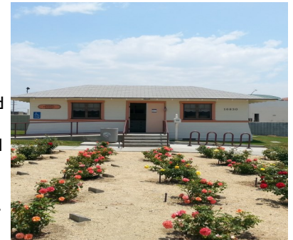
Fontana Historical Society Research Library.

After trying for two years to obtain the property, an anonymous individual borrowed the larger share of the cost and paid the interest for one year. The City of Fontana furnished