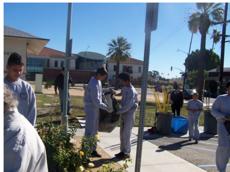
The FLIP Kids working together to clean up the Rose Garden.