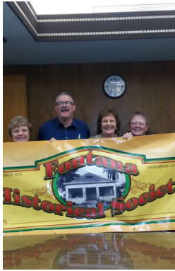
Our new sign!!!

“We are here to preserve local history and to serve the community.”