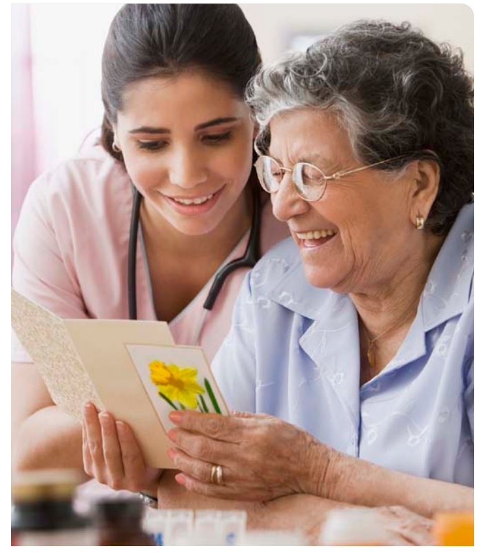
Hiring a home health aide is a great way to give yourself a break from the rigors of being the primary caregiver.

Finding caregiver training locally can be hit or miss. A good place to start is with your local Area Agency on Aging. Visit eldercare.gov to find an office near you.