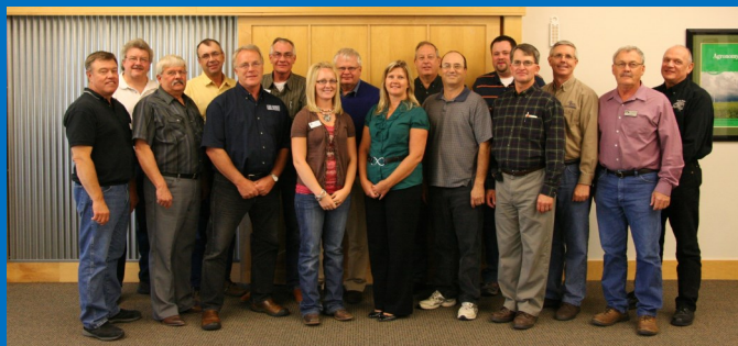
ND Farm Business Management