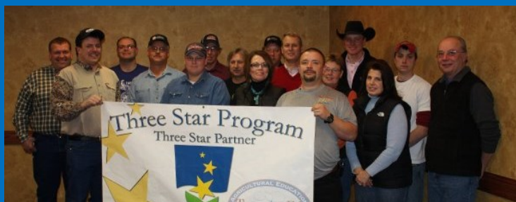
ND FFA Alumni

The ND FFA Foundation is a nonprofit organization. Contributions are tax deductible.