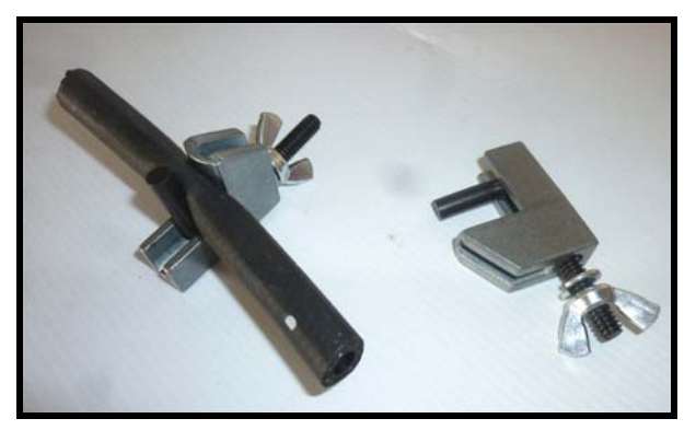
Figure 2 - Fuel line clamp

Figure 3 below shows the fuel line into the carburettor bowl(s) (D) and the overflow pipes (E).