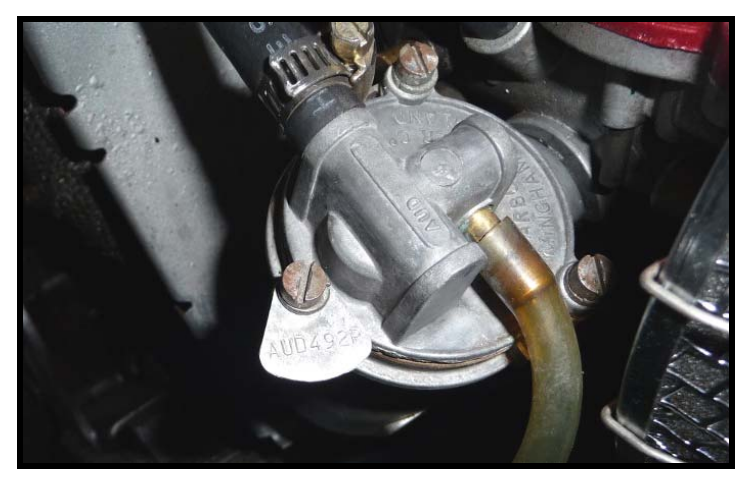
Figure 5 – Carb ID – AUD 492F

Note the part number on the SU carb – AUD 492 R, being the rear carburettor and AUD 492 F being the Front carburettor.