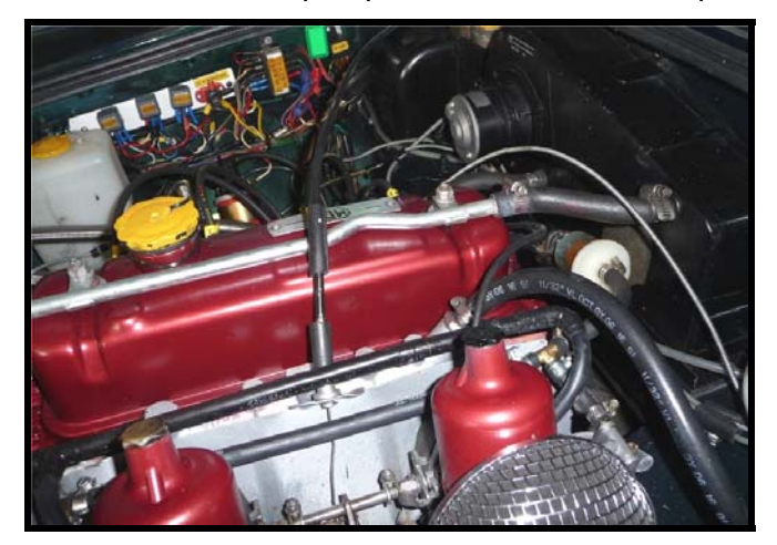
Figure 4 – Front Fuel Filter

A new steel fuel line installed between the fuel pump and the front filter as per Figure 4 below.