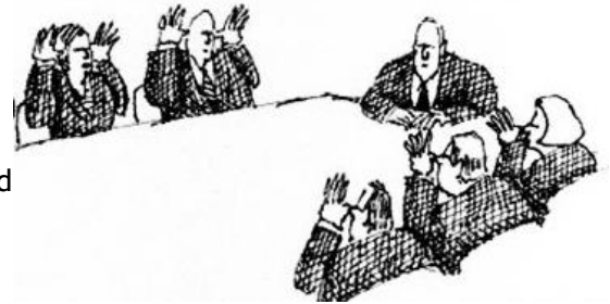
The Mediator sensed that negotiations were in trouble

B. Our next F2F negotiations are scheduled for November 18 starting at 4 PM in the Lido library.