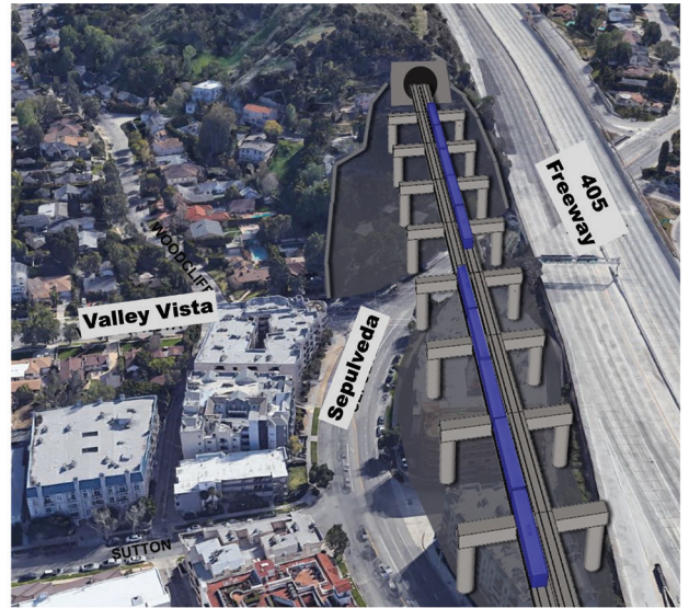
Alternative 4 Elevated Trains Demolish Hillside, Residences, and Businesses

Add your name and community, plus anything else you might like to tell her. Thank You for Protecting Our Communities.