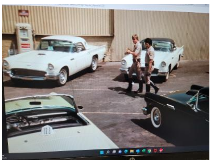
From Vince (CHIPS TV Show)