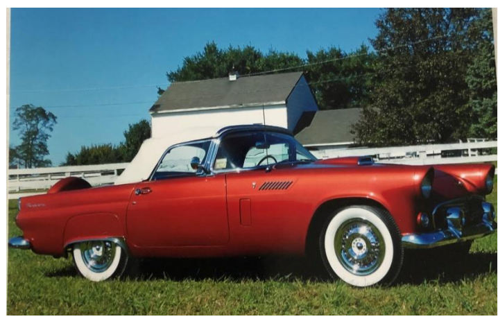
Tom Mirros 56 (see page 6)

That's about all for now. Stay healthy and enjoy the Spring Pat LeStrange