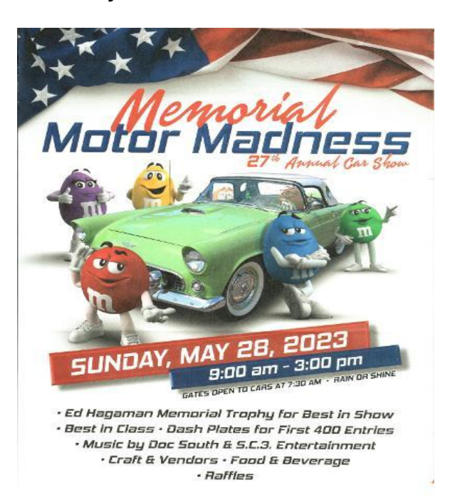
Mike Meehan's car on show flyer

Henry Ford made 8 different models of cars -A, B, C, F, K, N, R, S before producing the famous Model T