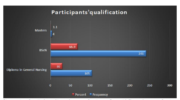
Graph 3. Distribution of the Qualification of the participants of the study (n=350).