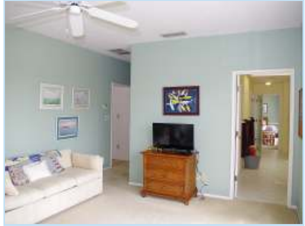
Guest Bedroom A