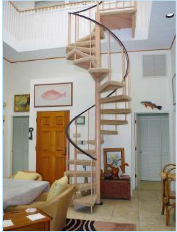
stairs to crow's nest