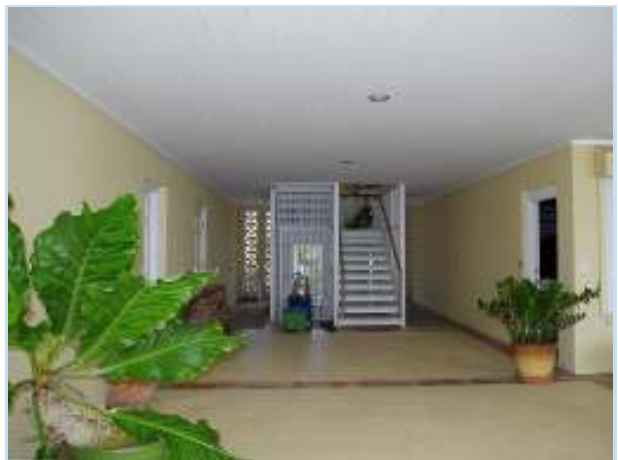
two 1-car garages, one on either side of the breezeway, access to captain's Quarters from breezeway