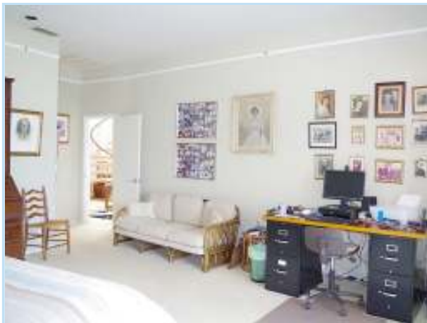
master suite large enough for office area