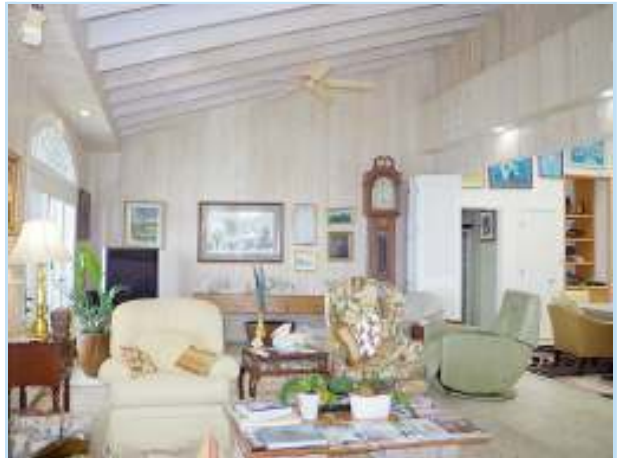
vaulted ceiling with exposed beams