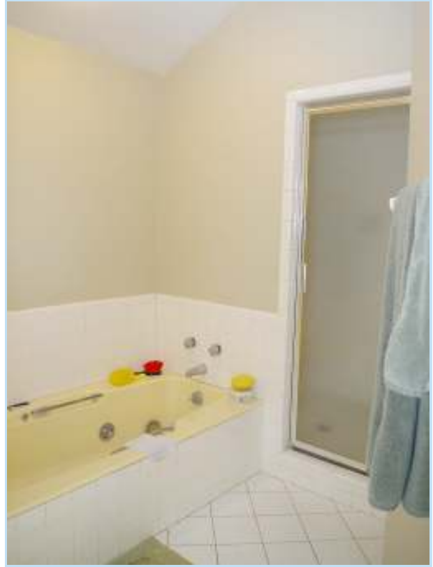
jetted tub and separate shower