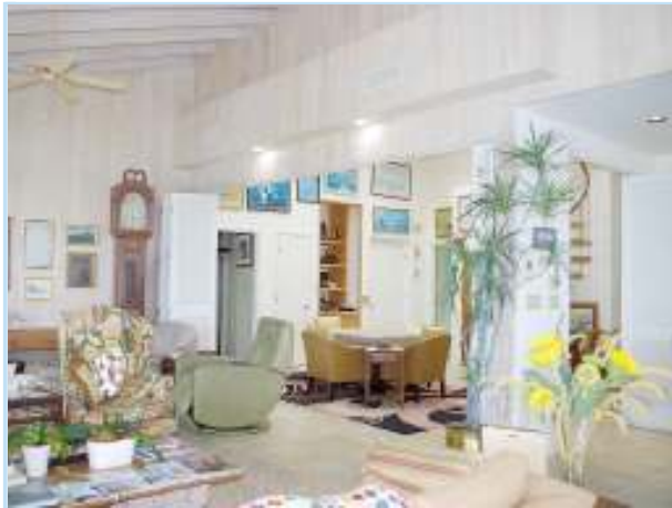
open concept living/dining/kitchen