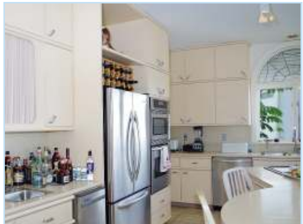
stainless steel appliances