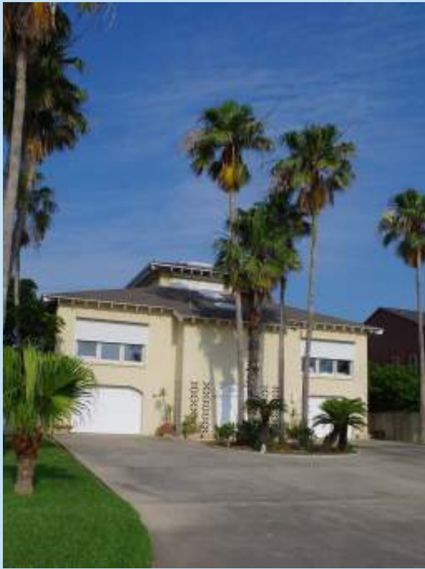
quiet cul-de-sac street