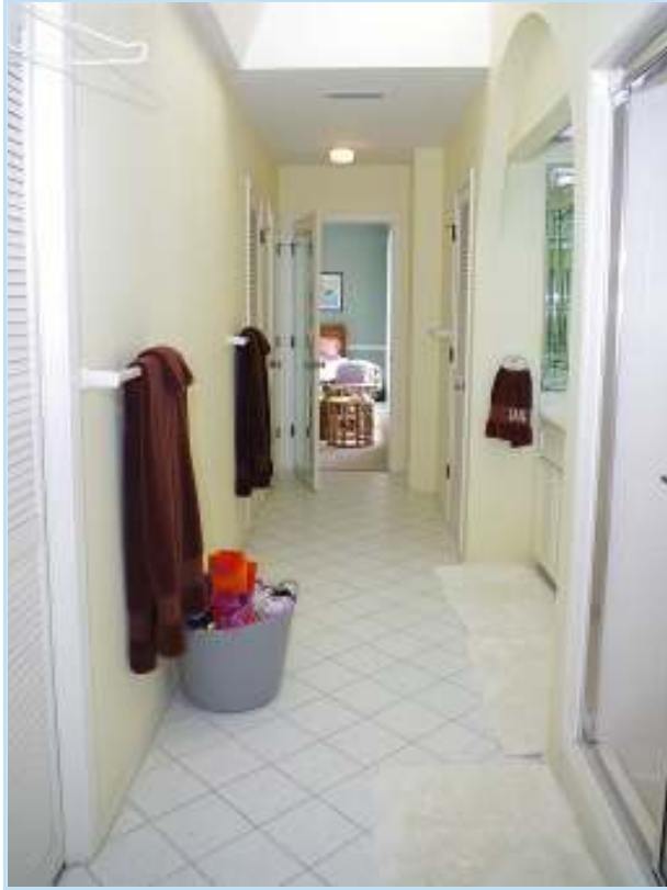
both guest rooms share Jack-n-Jill bath