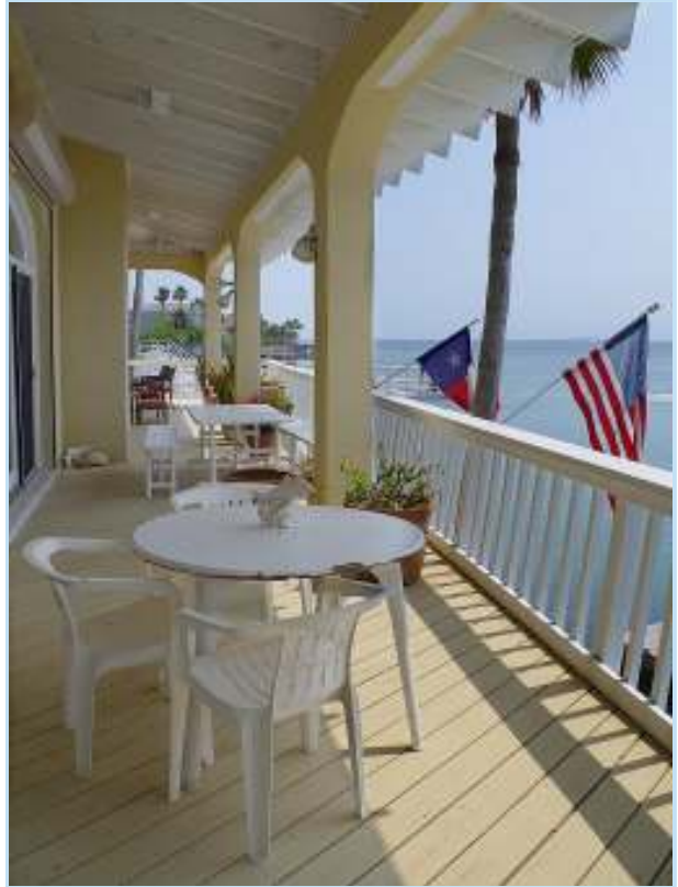
balcony spans the width of the home