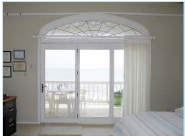
master has access to balcony