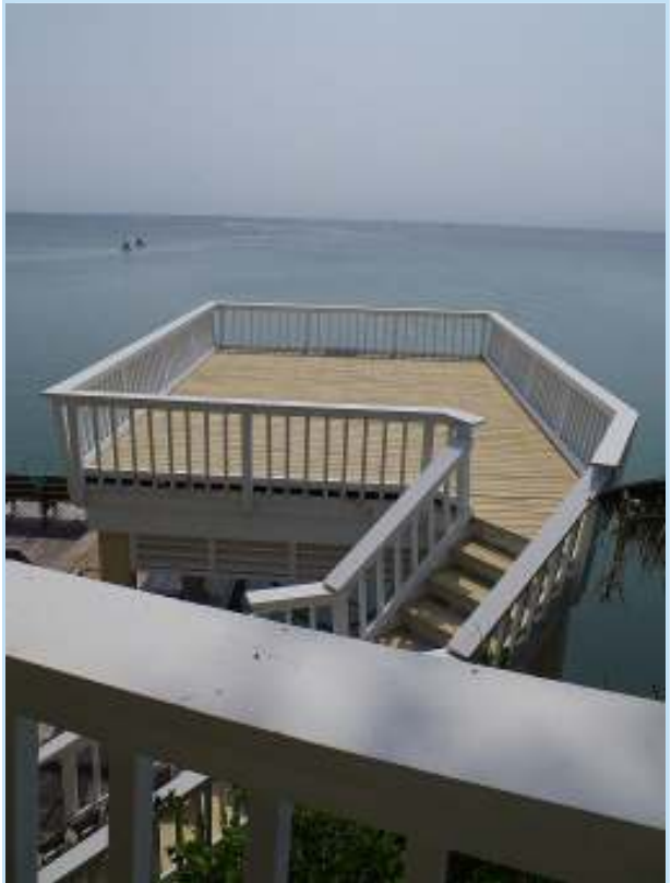
Deck Above Boat Lift