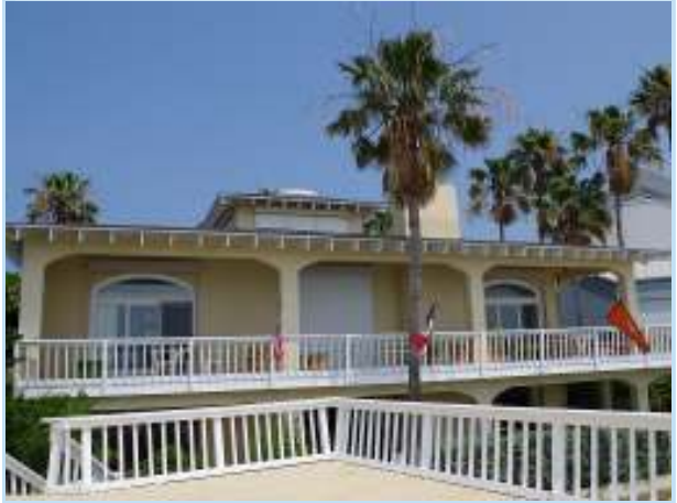
back faces west, great for watching the sunset