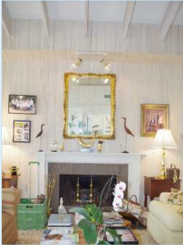
real wood-burning fireplace