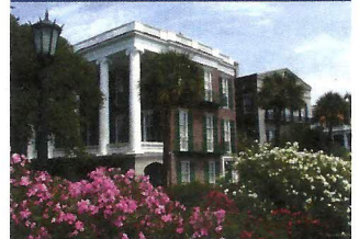
Charleston, SC - "America's Favorite City"