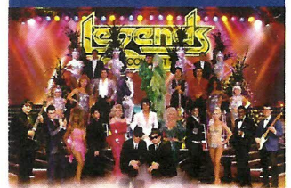
Exciting Legends in Concert