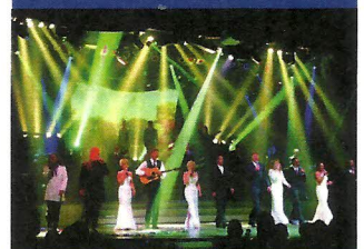
Fabulous Carolina Opry