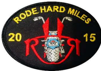
Rode Hard Miles