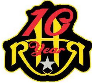
10 Year Member