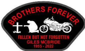
Giles Memorial Patch