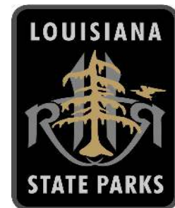
LA Parks & History