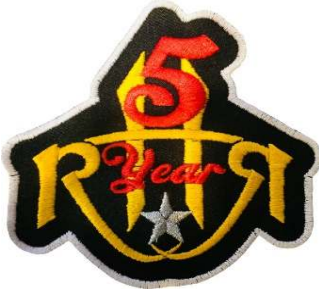
5 Year Member