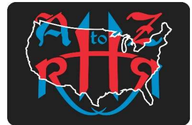
U.S. Cities A to Z