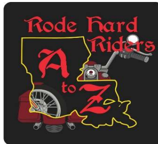
LA Cities A to Z