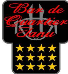
Bar de Quartier Tanu