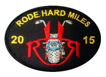
Rode Hard Miles