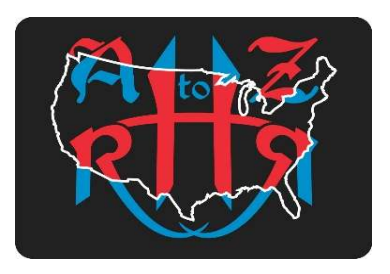
U.S. Cities A to Z