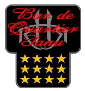
Bar de Quartier Tanu