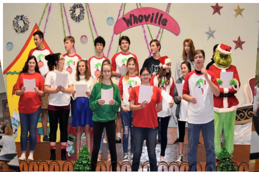
French Café 2018 Le Café de Whoville