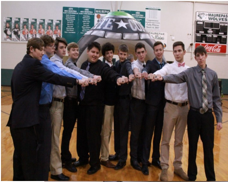
Juniors' Ring Ceremony 2018