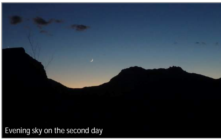
Evening sky on the second day