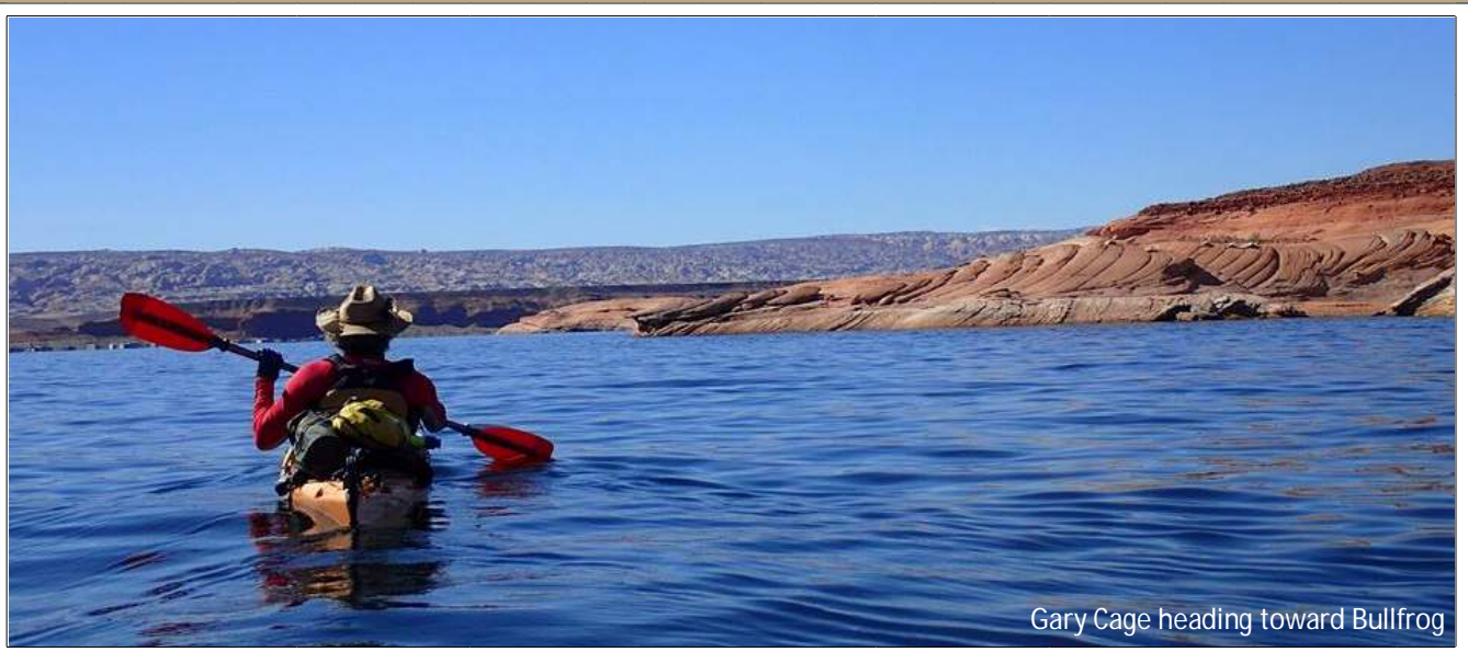
Gary Cage heading toward Bullfrog

DAY 6: We had a leisurely breakfast and were on the water by the crack of noon with a moderate tail wind which lessened as the day went on, and reached Bullfrog Marina around 4:30. It was a wonderful vacation.