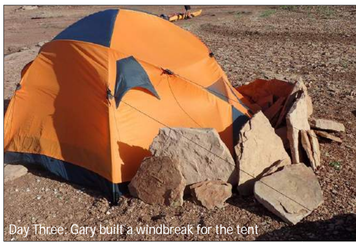
Day Three. Gary built a windbreak for the tent

About 2:00 in the afternoon it calmed enough for us to head up Farley Canyon to its end. At full pool (3700 feet), there is a road and campground at the water's edge. At this level there is what looks like an ATV track down to the water where a couple of boats were parked with a couple of campers parked up higher.