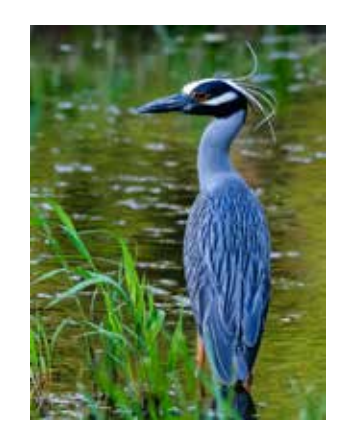
Yellow-Crowned Night Heron Craig Carter