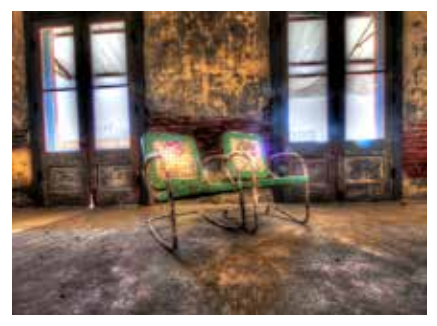
Two Comfortable Chairs Pete Holland