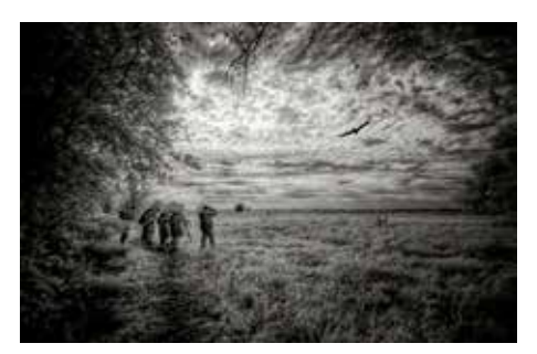
Early Morning Birders Pete Holland