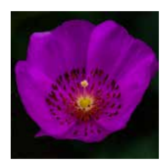
Purple flower Dolph McCranie