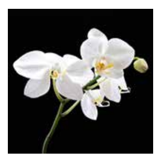
White Orchid Phil Charlton