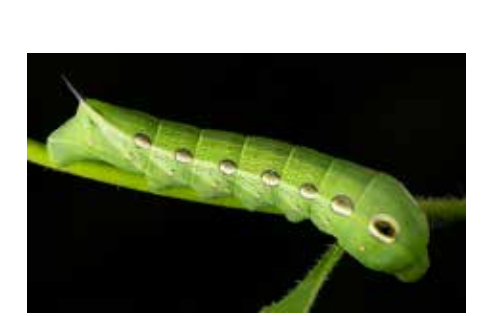
Tersa Moth Caterpillar