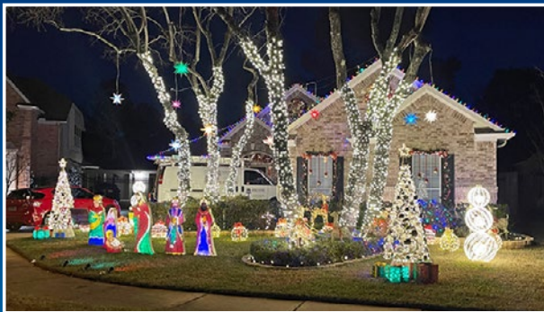
SECTION 3 | 7806 PERCUSSION PLACE