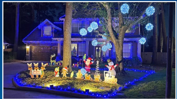
SECTION 4 | 9307 SINFONIA DRIVE