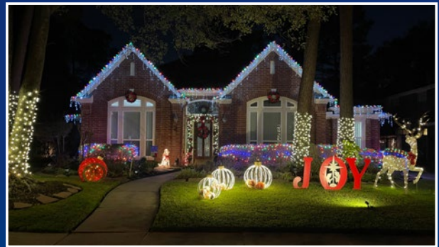
SECTION 2 | 9007 RHAPSODY LANE