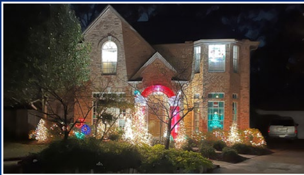
SECTION 1 | 7807 BRAHMS COURT