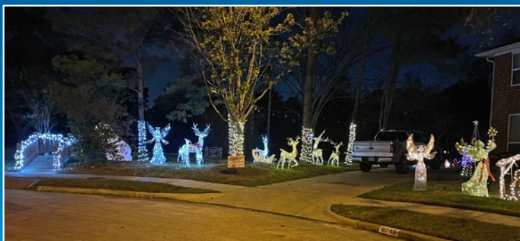
FRONT AND LAKESIDE | 8746 SERENADE LANE