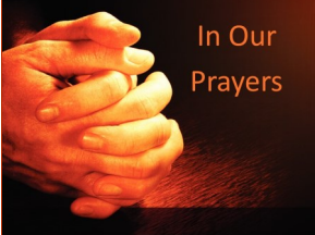
In Our Prayers