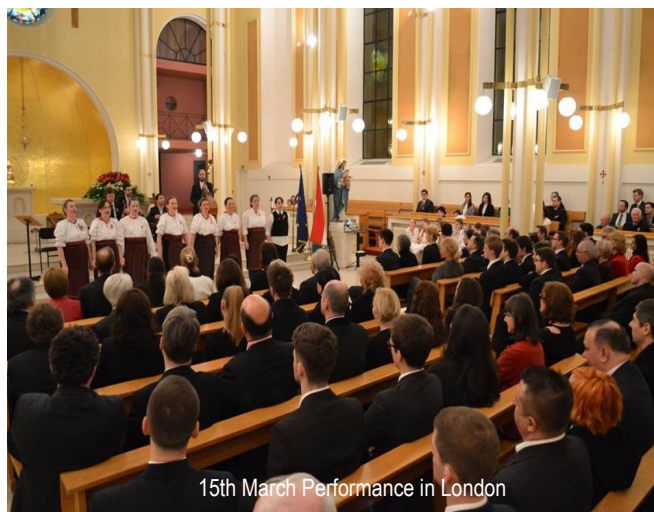
15th March Performance in London