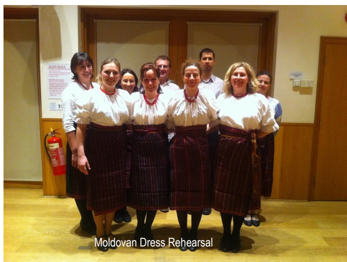
Moldovan Dress Rehearsal