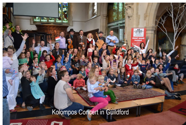
Kolompos Concert in Guildford