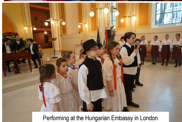
Performing at the Hungarian Embassy in London