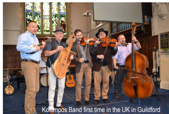
Kolompos Band first time in the UK in Guildford