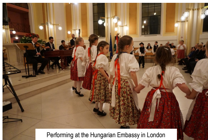
Performing at the Hungarian Embassy in London

The children performed their Moldovian coreographies and songs at public events in London and Kent and to their parents at the end of year celebrations at the St John's Centre in Guildford.