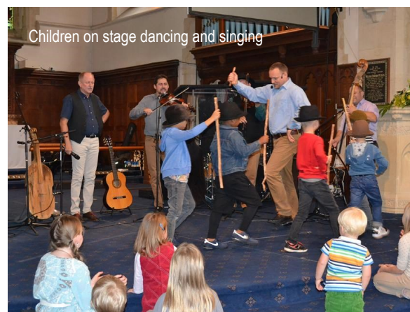
Children on stage dancing and singing