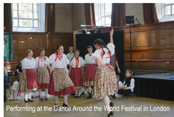
Performing at the Dance Around the World Festival in London