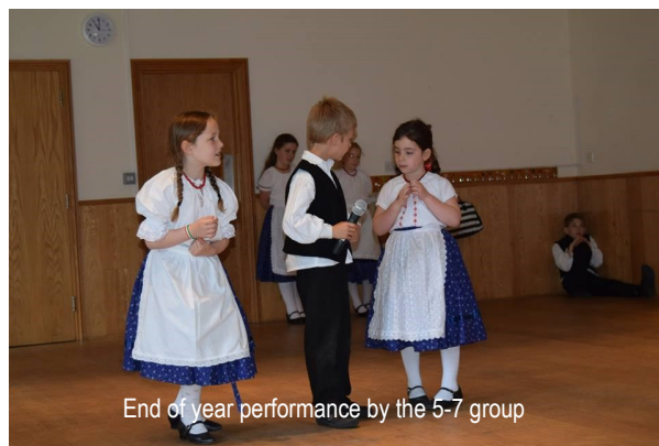
End of year performance by the 5-7 group