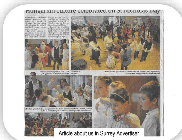
Article about us in Surrey Advertiser