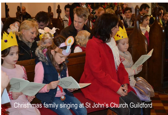
Christmas family singing at St John's Church Guildford