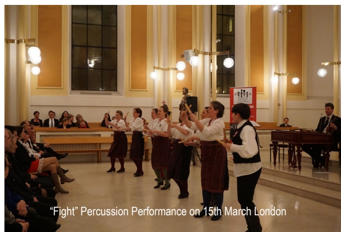
"Fight" Percussion Performance on 15th March London