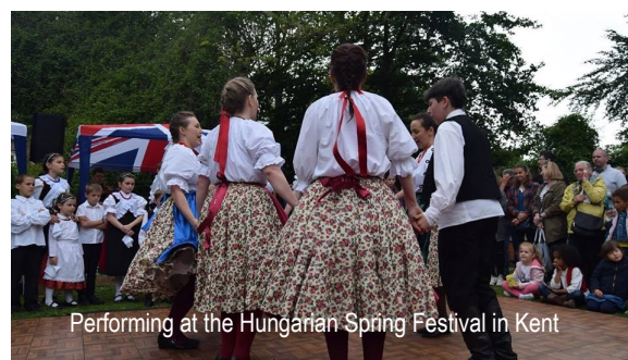
Performing at the Hungarian Spring Festival in Kent