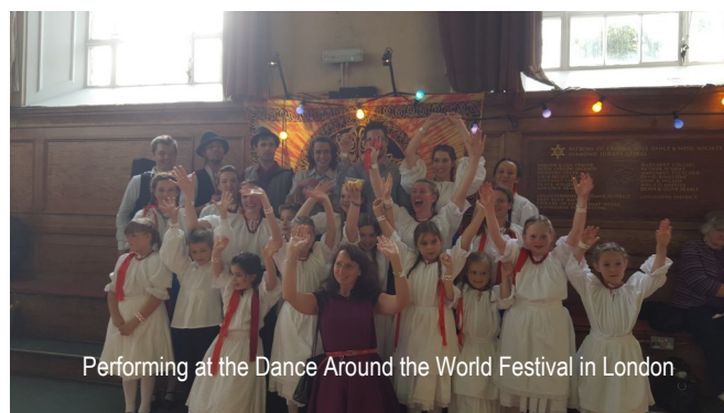
Performing at the Dance Around the World Festival in London