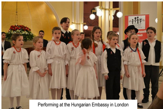
Performing at the Hungarian Embassy in London