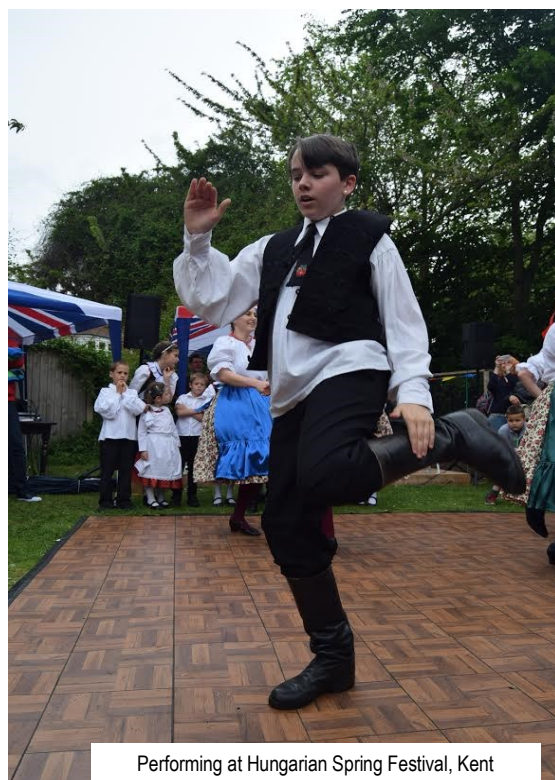
Performing at Hungarian Spring Festival, Kent