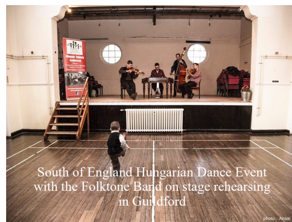
South of England Hungarian Dance Event with the Folktone Band on stage rehearsing in Guildford