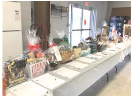
Ham dinner plate and baskets for Silent Auction