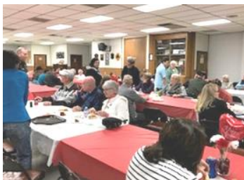
Kitchen crew, guests, and desserts for Spaghetti Dinner