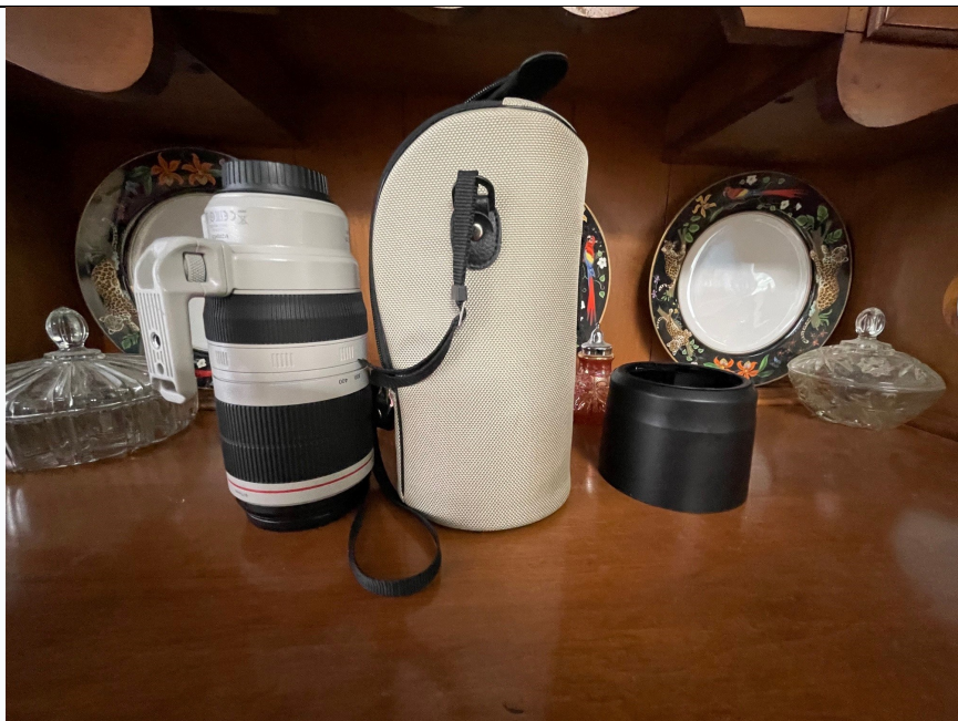
Canon 150 – 400 – 50mm lens $1,500

Contact Cathey Roberts for details catheyr@mac.com