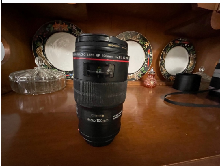
Canon 100mm macro 2.8 lens $750