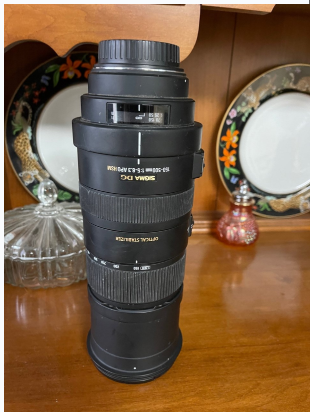
Sigma 150 – 600mm lens $1,000