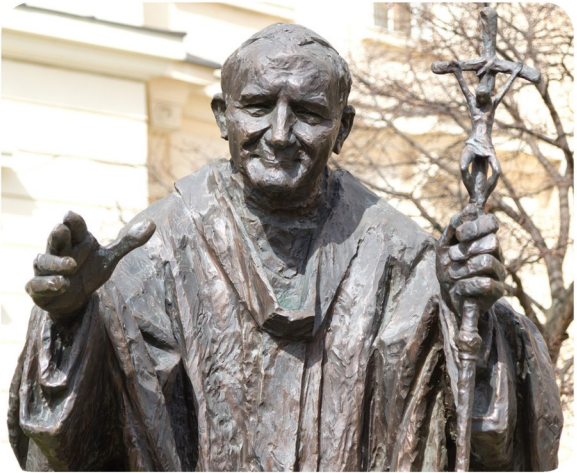
Sculpture of a smiling Pope St. John Paul II outside the Saint John the Baptist Cathedral in Trnava, Slovakia.

For a spirit of unity and Thanksgiving to be cultivated in our lives and in our nation. That we may see God’s light reflected in the blessings of our family, friends and community.