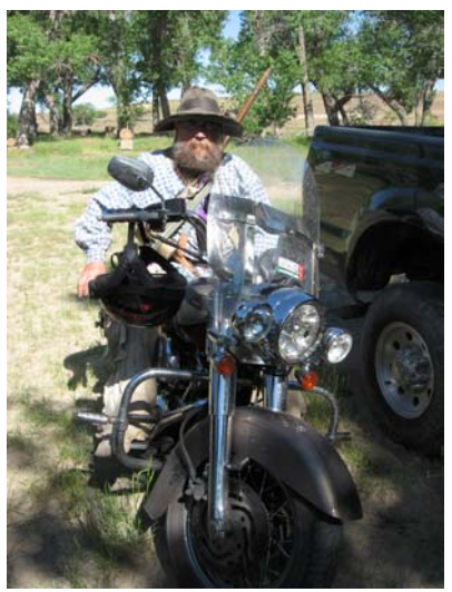
Harley Davidson's new mascot Tail gunner