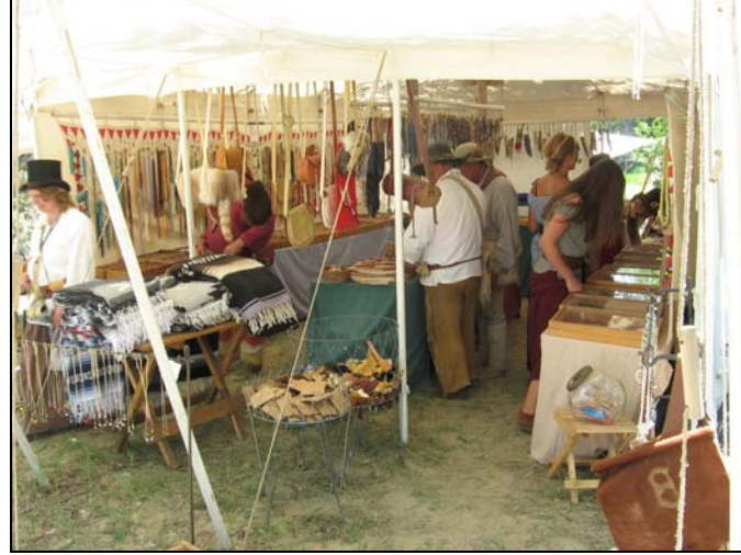
View of a trader's tent stocked with fooferaw