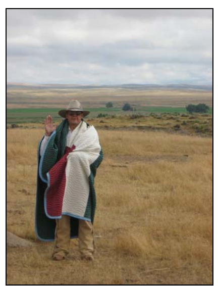
Chief Shivers-a-Lot was on hand to greet us and help set up the range. Come to think of it the weather was a mite nippy.