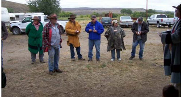
Award's at BHBMLA 2008 Just a little wet and cool.

God, grant me the senility To forget the people I never liked anyway, The good fortune To run into the ones I do, And the eyesight to tell the difference