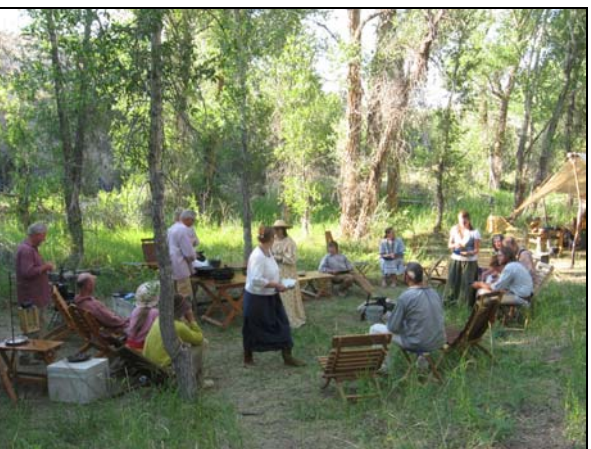
One of several delicious pot luck dinners