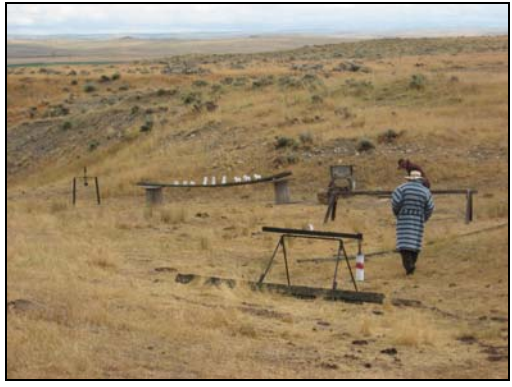
View of makeshift range