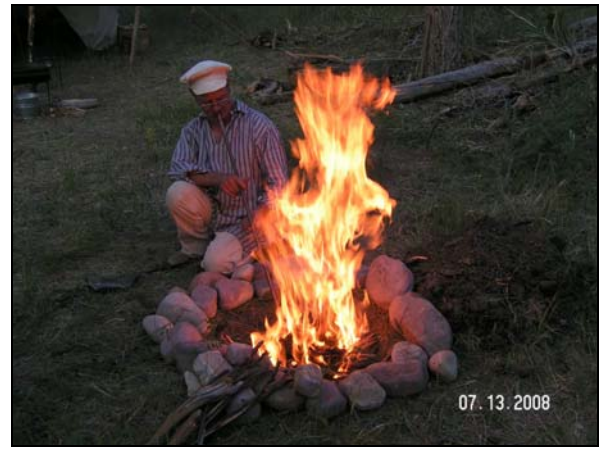
Magic uses a little natural hot air to blow up a big campfire