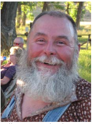
Mill House at his best.