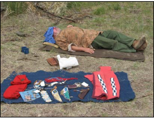
Rendezvous is for relaxing! Here a trader takes a snooze