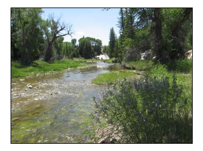
View along Henry's Fork of the lush greenery