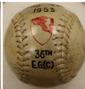
Front and back photographs of the softball. The ball was also signed by the players, however, the signatures are barely visible.